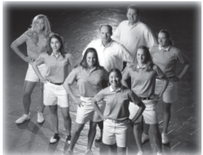
In the 2003-04 campaign, the Blue Devils won a school-record 10 tournaments and finished third at the NCAA Championship.