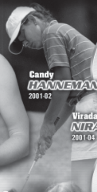
Candy HANNEMANN 2001-02