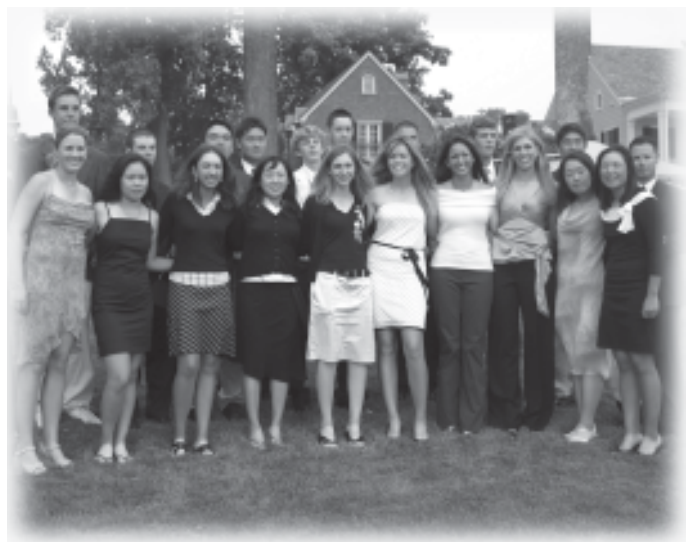
2004 Canon Cup Team