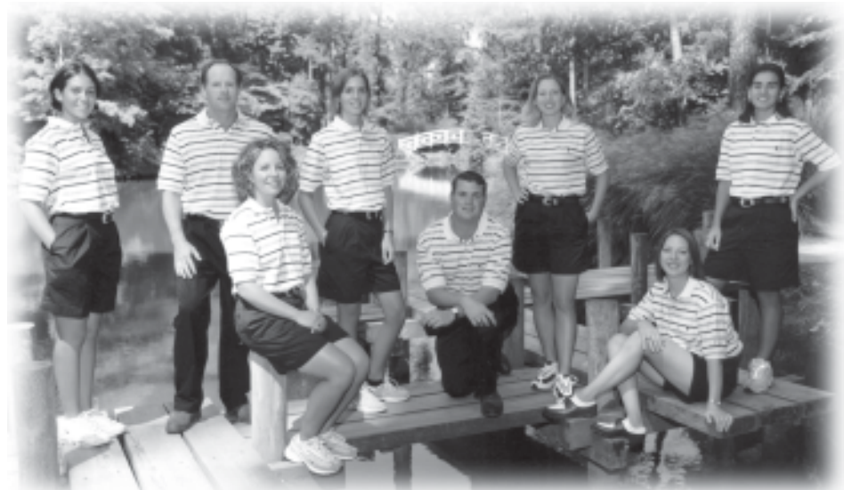
The 2000 Duke team won the second East Region Title in school history.

Duke's NCAA East Regional Team Champions