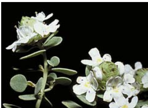
Flowers of Prostanthera schultzii