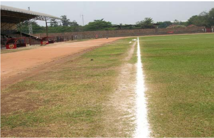
The Stade Prince Louis Rwagasore, Bujumbura before the play- During the renovation work. ing surface was renovated.

Further information on Win in Africa with Africa: http://www.fifa.com/mm/goalproject/WinAF_E.pdf