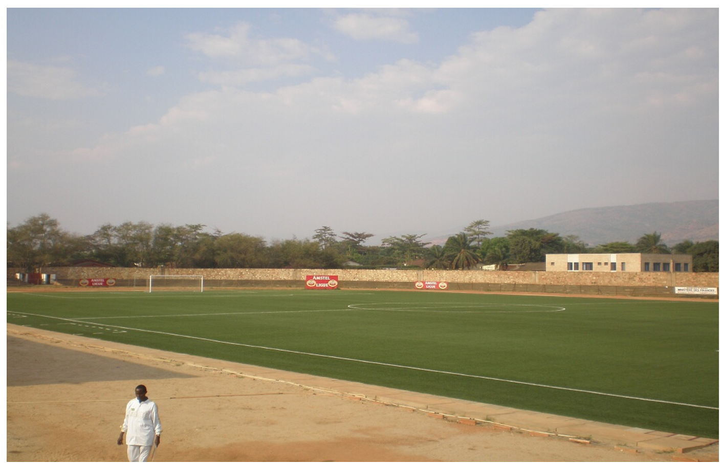
The eight-team CECAFA U-17 international tournament was played on this surface in August 2007.