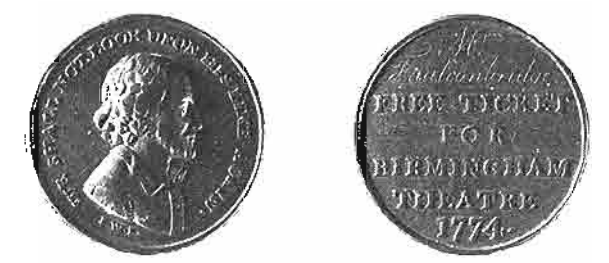
Fig. 1. The 'Birmingham Theatre' pass, 1774, produced for use at the New Street Theatre, Birmingham.

successful that the one in Moor Street was forced to close in 1764 and the building became a Methodist chapel.<sup>6</sup>