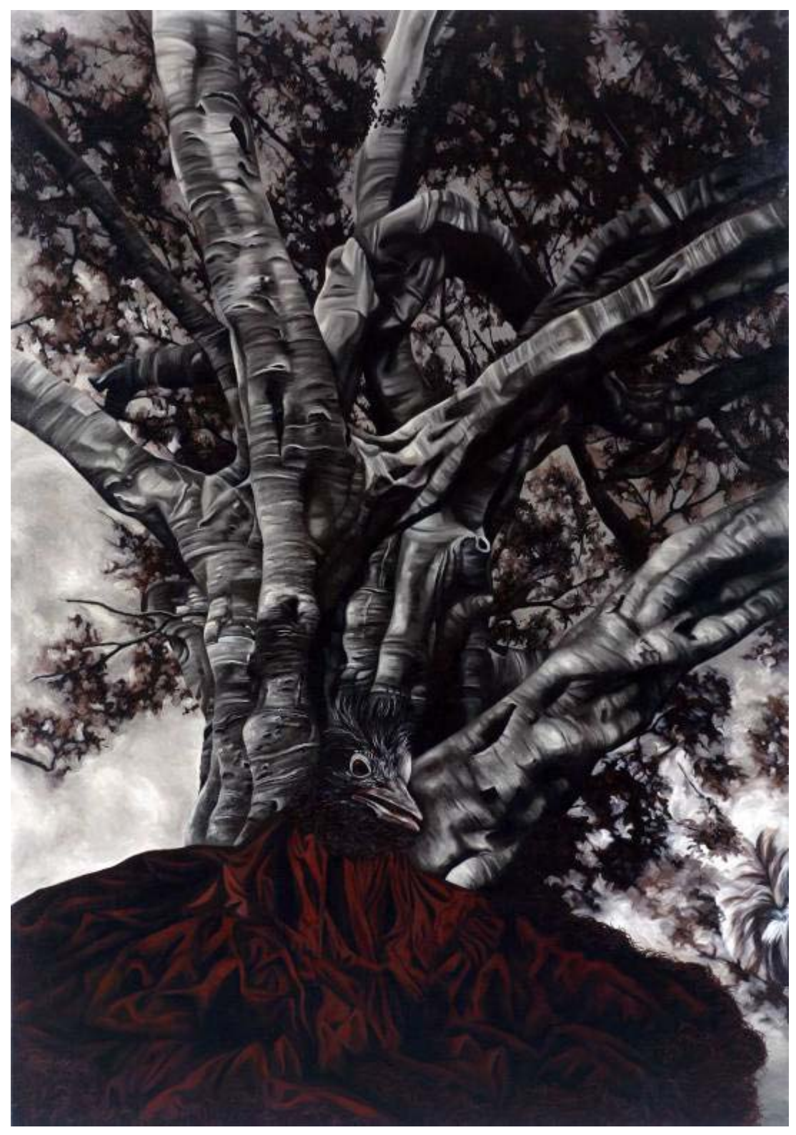
Good vs Evil (panel 1) 2011 | Oil on canvas | Left, 152.4 x 228.6 cm