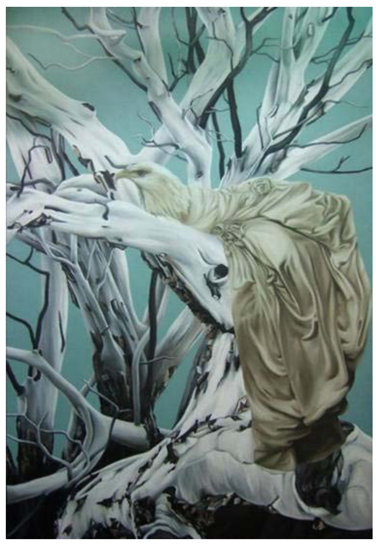
Good vs Evil (panel 4)

2011 | Oil on canvas, 15 vitrines with embroidery | 4 Panels: 152.4 x 228.6 cm, 228.6 x 152.4 cm each