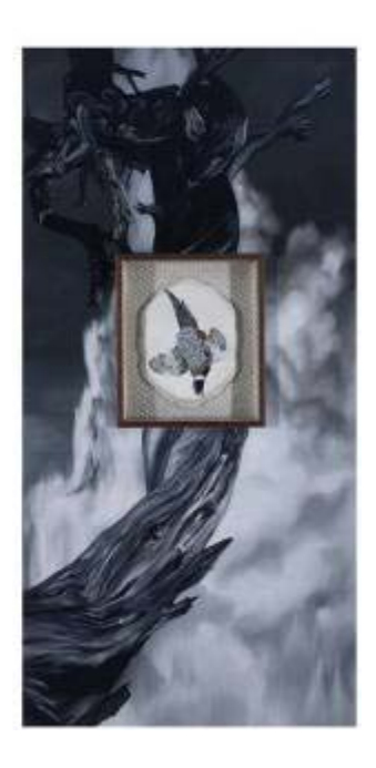
\label{eq:continuous} The \ Crucifixion $$ 2010 \mid Oil \ on \ canvas, \ 3 \ vitrines \ with \ embroidery \mid $$ Triptych: middle 243.8 \ x \ 121.9 \ cm, \ right \ and \ left \ 203.2 \ x \ 101.6 \ cm $$ $