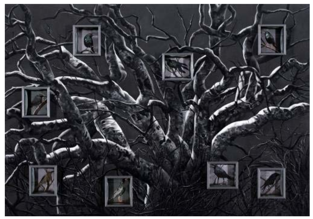
Good vs Evil (panel 2)

2011 | Oil on canvas, vitrines with embroidery | 228.6 x 152.4 cm