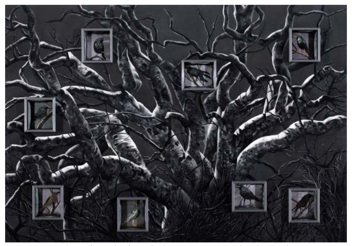
Good vs Evil (panel 2) | 2011 | Oil on canvas, vitrines with embroidery | 228.6 x 152.4 cm

Period | Tuesday, May 17 - Sunday, June 12, 2011