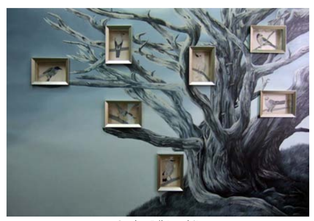
Good vs Evil (panel 3)

2011 | Oil on canvas, vitrines with embroidery | 228.6 x 152.4 cm