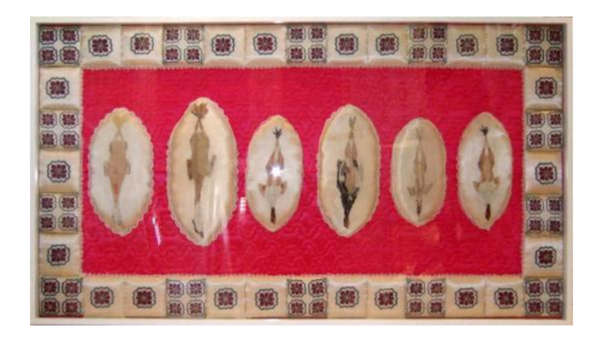
The Last Supper 2011 | Embroidery | 91.4 x 431.8 cm