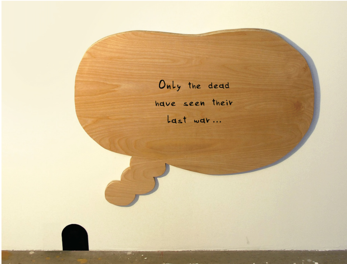
Plato's Mouse Hole, 2008, Edition 1/2 28h x 30w, wood, vinyl Exhibited at the Japanese American Museum, LA and in Chicago.