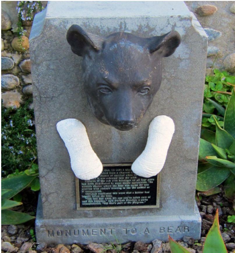
Monument to a Bear, 2003, edition 2/2 34h x 20w x 11d, Concrete and bronze

Edition 1/1 is permanently on display in the sculpture garden of the Museum of Contemporary Art, San Diego at La Jolla