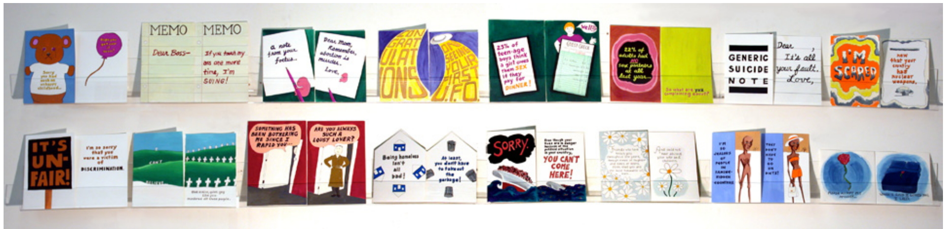
Greetings IV, 1992, 26h x 96w x 2d, Gouache on paper "greeting cards." Plexiglass shelves