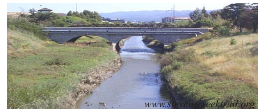
www.stevenscreektrail.org (Near Shoreline Sailing Lake, the Trail crosses Permanent Creek just before it enters the San Francisco Bay.)