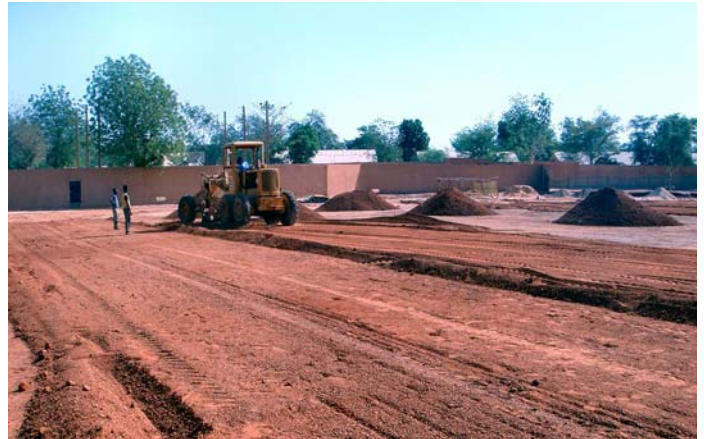
Intensive ground work at the Stade Municipal as part of Win in Africa with Africa.