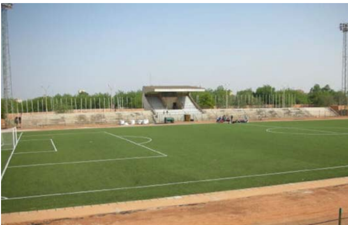
The new football turf pitch shortly before its inauguration.