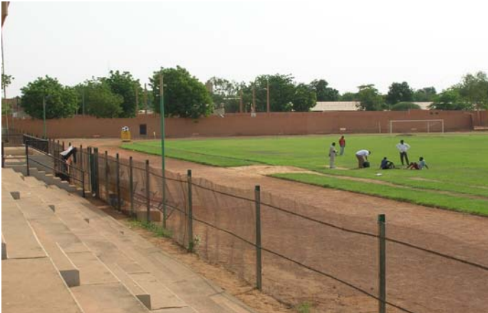
Poor conditions at the Stade Municipal de Niamey led to an all-weather artificial solution.

Further information on Win in Africa with Africa: http://www.fifa.com/mm/goalproject/WinAF_E.pdf