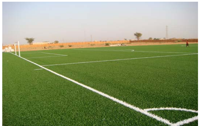
Another football turf pitch has been installed at the technical centre as part of the Goal Programme.