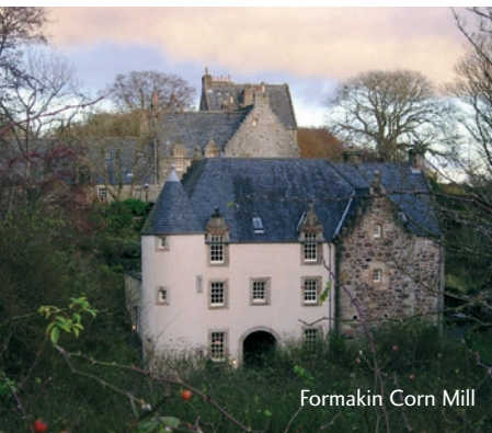
Formakin Corn Mill

8 Turn round so that the gate and wall are directly behind you, and go straight ahead between the two hedges (no monkey). Take the first left (20m) along another wide grassy path lined with hedges. After 50m this brings you out onto a track, which comes from the Mansion House on your left. Turn right along the track (ignore the little monkey pointing straight on), through a pair of stone gateposts after just over