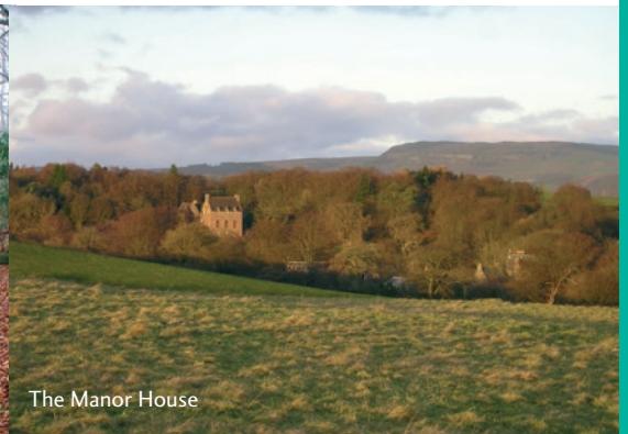
The Manor House