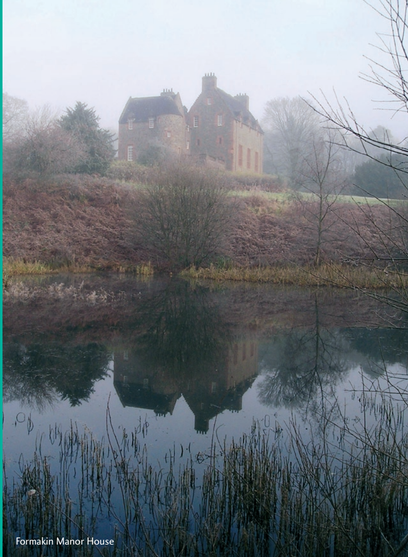
Formakin Manor House

of hundred metres. After a short downward slope, there is a little monkey pointing over a stile on your left. Turn left over the stile, and then follow the wall and fence on your left.