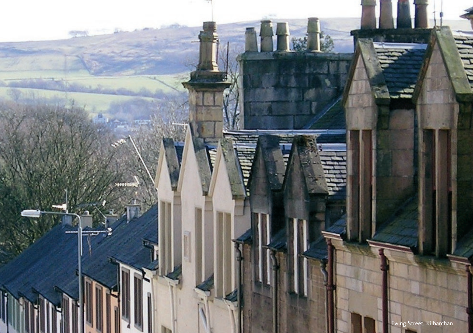
Ewing Street, Kilbarchan