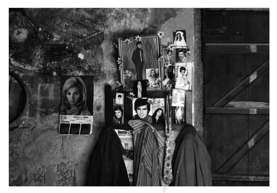
Fig. 8.2 Detail from Nativity in 1974

naked with halo standing in the Jordan, with a ray of light perpendicularly descending from the orb of heaven and with the dove evident. To the right two angels are holding their garments. The lower parts are already deteriorated. There is only a vague sense of the garments flowing down on each side. The photos taken by Wilbert Norman in 2007 seem to show clearly and in good colour the head of the furthest angel and the feet of John with graffiti in various languages carved over it.<sup>43</sup>