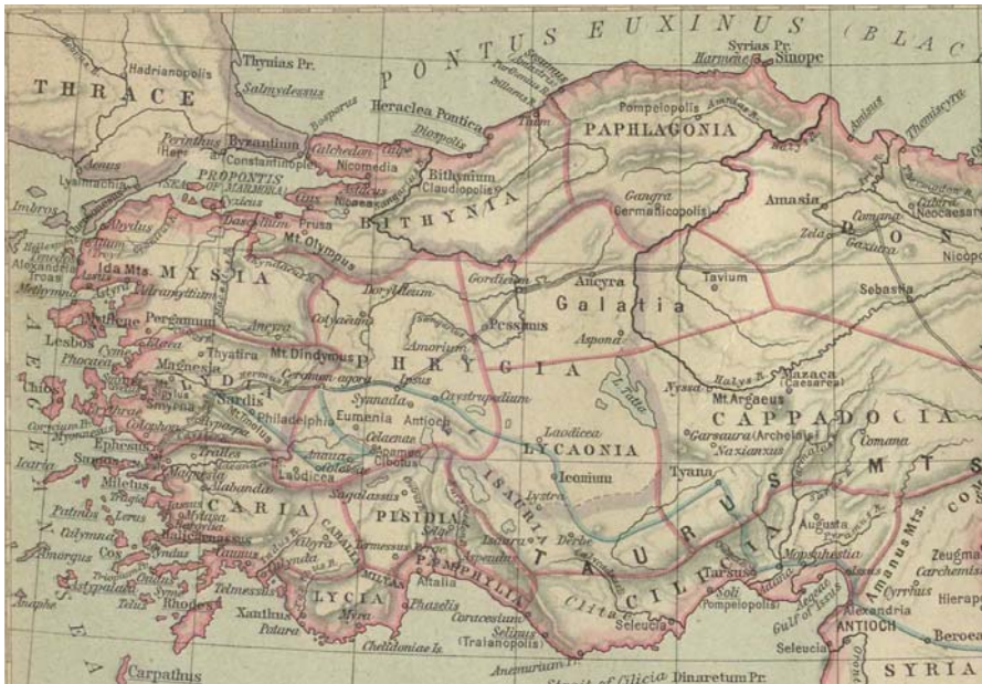
Map 2. Ancient Ankara (Ancyra) region.

territory of Bithynia was restricted to an area west of the Sangarius River (now Sakarya River) in the North and North-west, Phrygia (this ancient district is located between Galatia and Lydia on the east and west and Bithynia on north) in the West, Lycaonia (this ancient district is located between Galatia and Cilicia on the north and south and Phrygia and Cappadocia on the west and east) in the South and Cappadocia (this ancient district is located in north of Taurus Mts. and Galatia on the northwest and Pontus on the northeast) in the far South-east in ancient geography. The modern capital of Turkey, Ankara (ancient Ancyra), was also the capital of ancient Galatia (the region lies in the basins of the present-day Kızılırmak and Delice rivers, on the great central plateau of Turkey) (Map 2).