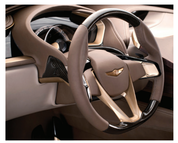
The Hyundai HCD-14 concept's Soft Connect gesture-recognition system picks up hand signals.

"We expect third-generation gesture-recognition systems in luxury cars by 2017," Boyadjis said. He also cautioned that "there is such a thing as 'touch gesture recognition' with capacitive screens, but this is something entirely different" and accounts for some of the current confusion about the technology.