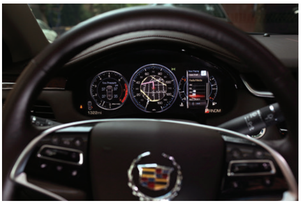
The 2014 Cadillac XTS luxury sedan features GM's pioneering CUE touch-less control system.

If you then speak "radio volume knob" (or similar keywords), the cockpit's voice-recognition function causes the radio controls to pop up on the screen, ready for instructions. Simulate turning a real-world, physical volume control as you normally would with your fingers (or some circular motion) and the gesture system boosts or diminishes the speaker loudness as desired. It's as easy as that.