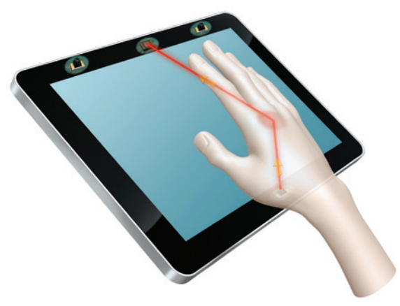
A simple IR reflex camera can locate a driver's hand space using a LIDAR-type ranging method.

"The high output is made possible by state-of-the-art thin-film chip technology and, combined with the small