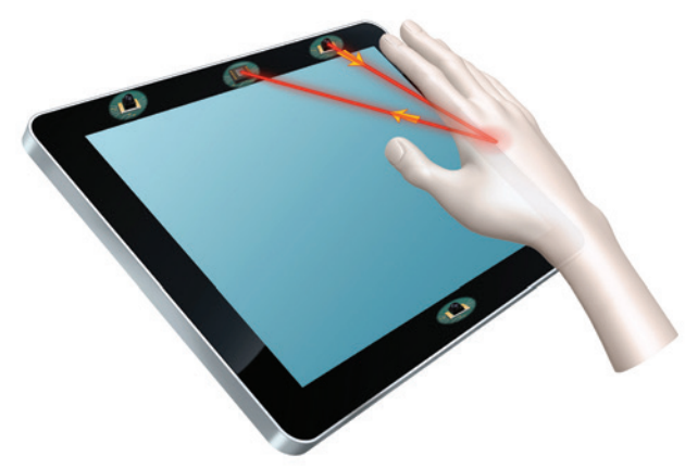
Proximity controls rely on IR emitters and receivers to gauge time-of-flight to register 3D hand position.

Boyadjis breaks the range of touch-free sensing technologies into three classes. The first generation will be of the basic proximity type, which use small, inexpensive infrared sensors with a range of a couple of inches to enable displays to wake from sleep modes when the sensor detects the presence of a hand or finger or to handle simple commands. He cited the Cadillac User Experience (CUE) system and the VW Golf's advanced HMI as early examples in mass-market production vehicles. In CUE, two infrared sensors that are sited just below the screen detect when a user's hand approaches the screen and activates frequently used menus.