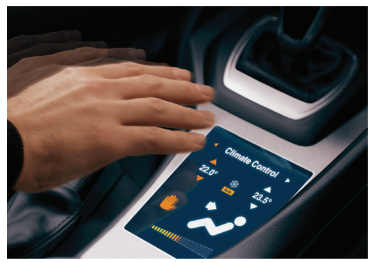
Osram Opto Semiconductors makes infrared sensors that can enable automotive gesture-recognition controls.

package, opens up numerous new applications, particularly where there is very little available space but performance demands are high," he added. "If required, components can be packed very close together to increase the optical output with a high degree of flexibility." The result would be a multi-receiver matrix that "can interpret learned hand gestures such as left-right or right-left swipes."