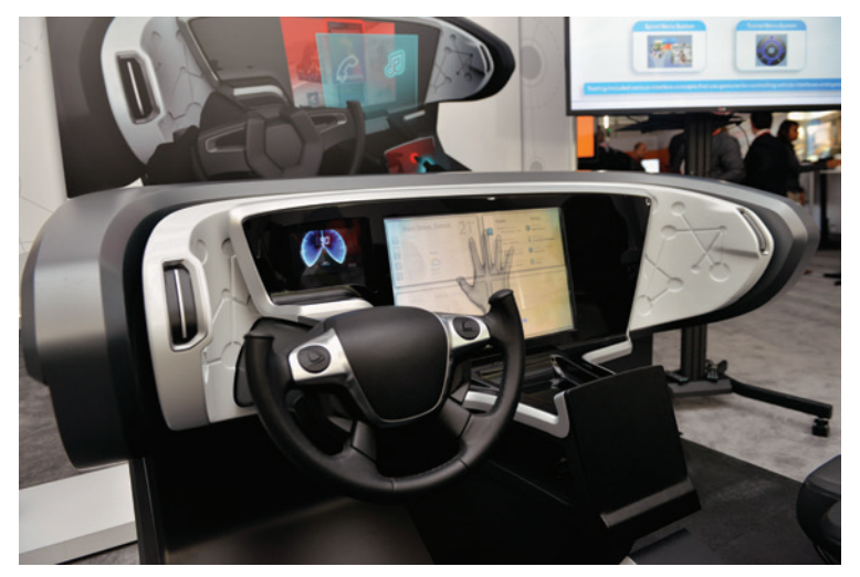
Visteon's Horizon cockpit concept display at 2014 CES demoed true gesturecontrol features.