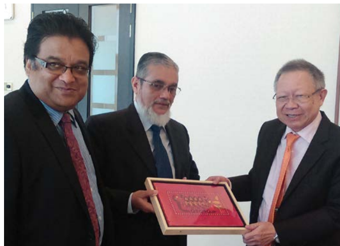
Bangladesh PSC visit