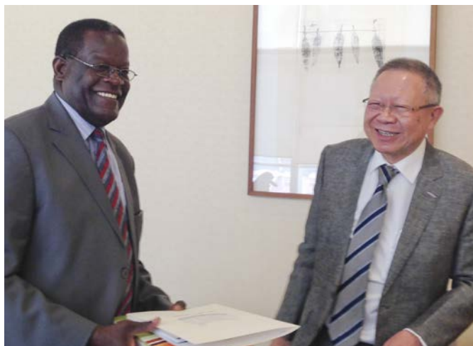
Namibia PSC visit

The PSC hosted delegations from the Namibia and Bangladesh Public Service Commission when they visited Singapore on 15 October 2014 and 2 December 2014 respectively.