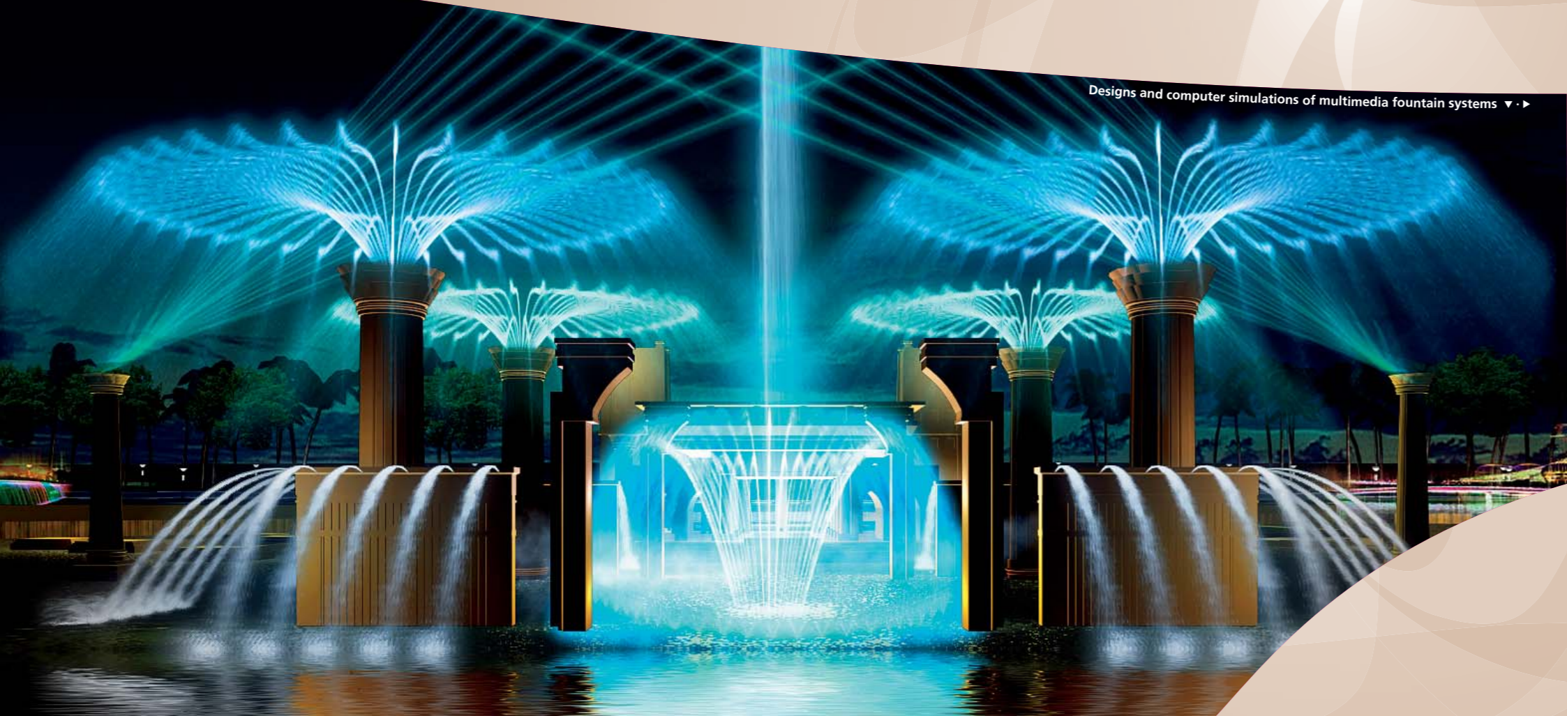
Designs and computer simulations of multimedia fountain systems ▾ ▶

WE TAKE CHARGE OF THE ENTIRE SHOW CONCEPT – BOTH CREATIVELY AND TECHNICALLY. WIR ÜBERNEHMEN DAS GESAMTE SHOW-KONZEPT – KREATIV WIE TECHNISCH.