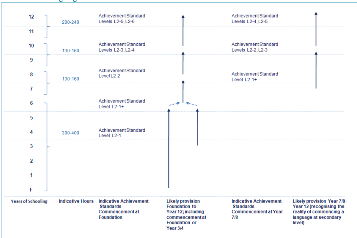
Diagram 1: Relationship between hours of study and achievement standards – second language learners

77. The relationship of indicative hours of study and achievement standards (and related curriculum content) is depicted in the three diagrams below, which recognise the diverse backgrounds of learners. The student cohort in each language may or may not include the range of learners depicted in the three diagrams. For example, the student cohort learning Chinese in Australia includes second language, home users and first language learners, whereas the student cohort learning French in Australia comprises primarily second language learners. Each diagram represents a distinct group of learners.