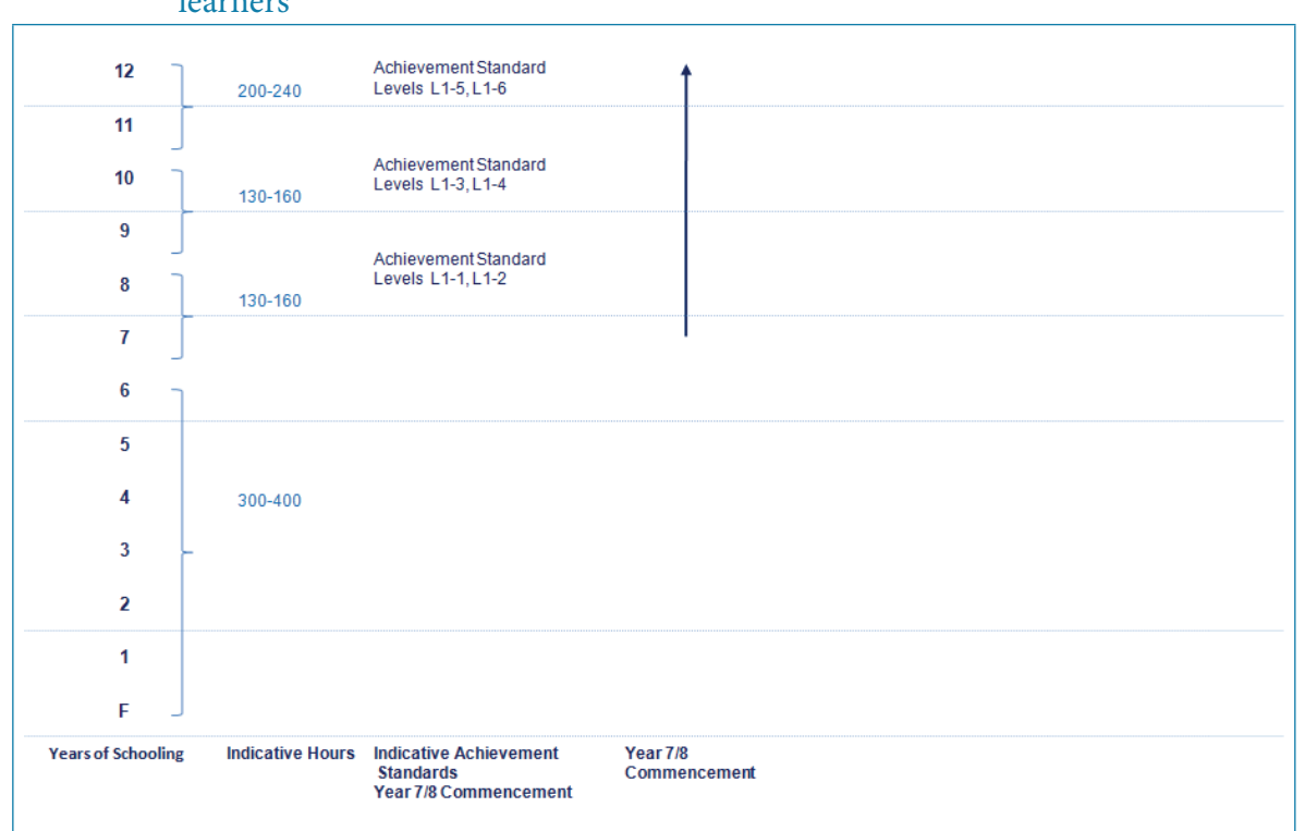
Diagram 3: Relationship between hours of study and achievement standards – first language learners

Diagram 3 depicts the relationship between indicative hours of study, achievement standards, and the most likely forms of provision for first language learners