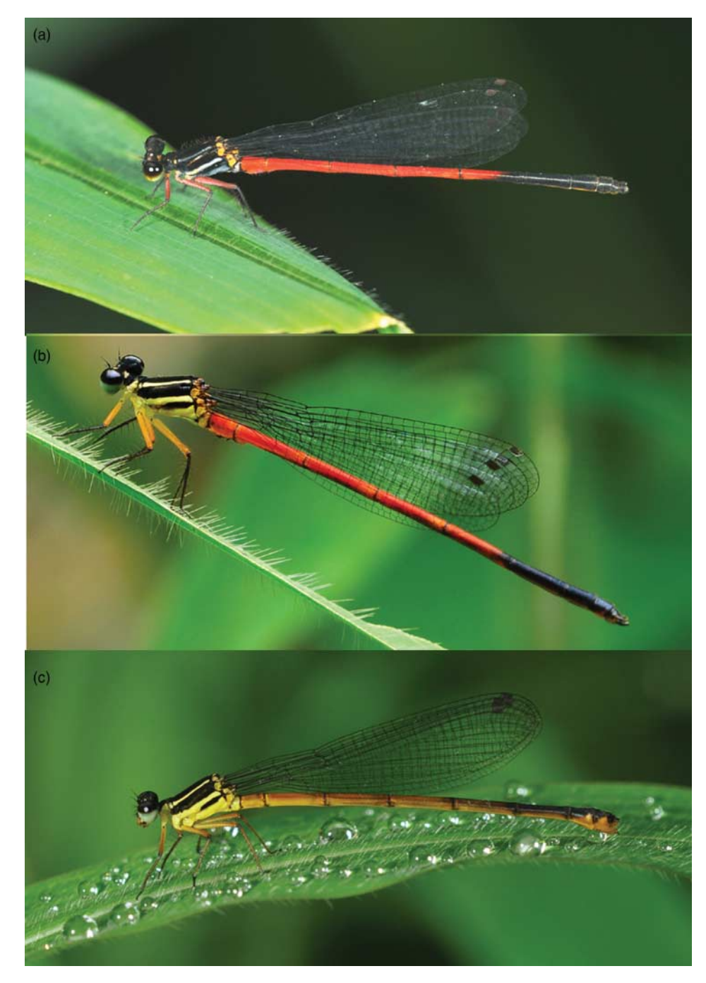
Figure 2. Calicnemia soccifera sp. nov., field photos, paratypes: (a) mature male; (b) semimature male; (c) female.