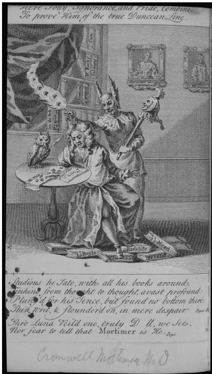
Figure 2. Royal Society secretary Cromwell Mortimer depicted by William Hogarth, engraved by Rigou, c.1745.