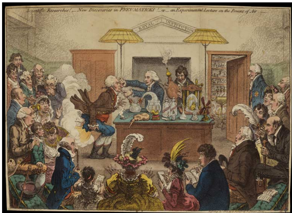
Figure 1. 'Scientific researches!' Gillray's satirical print (1802) of a Royal Institution lecture, featuring Humphry Davy and Benjamin, Count Rumford.

The Society's archives contain several types of tribute or memorial volumes combining text, manuscript and portraiture. These are generally associated with individuals, most importantly Charles Turnor's astonishingly ornate Newtoniana 7 compiled in the mid-nineteenth century. Broadley's compendium is unusual in this context in that it relies on an existing book-template, and this has partly influenced the selection of autograph material that the collector has pasted in. Because Weld, in true nineteenth-century style, habitually refers to well-known narratives of science, the effect is to build a mini-collection of iconic manuscripts. For example, when Weld's text refers to a specific event (such as the miners' safety lamp dispute between George Stephenson and Humphry Davy) the specimen letter takes up the theme. The rest of this report will describe, in chronological order, a selection of key letters from the volumes.