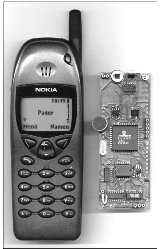
Figure 2. The sensor board and the enhanced mobile phone prototype.

A set of cues has to be identified that reduces the amount of data but not the knowledge about the situation. Based on the cues, selected as above and applied to the data recorded, an algorithm is selected that recognizes the contexts with maximal certainty and is also suitable for the usage of the artifact (e.g., adaptive vs. nonadaptive,