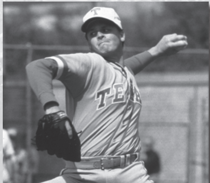
Greg Swindell is the only UT player and one of only seven Division I pitchers to record over 500 career strikeouts.