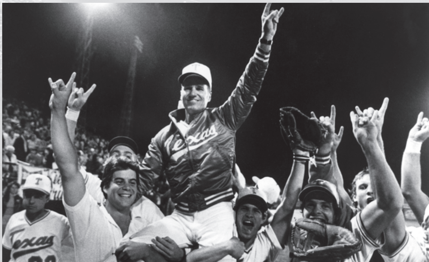
The 1983 squad won a school-record 66 games en route to winning the College World Series.