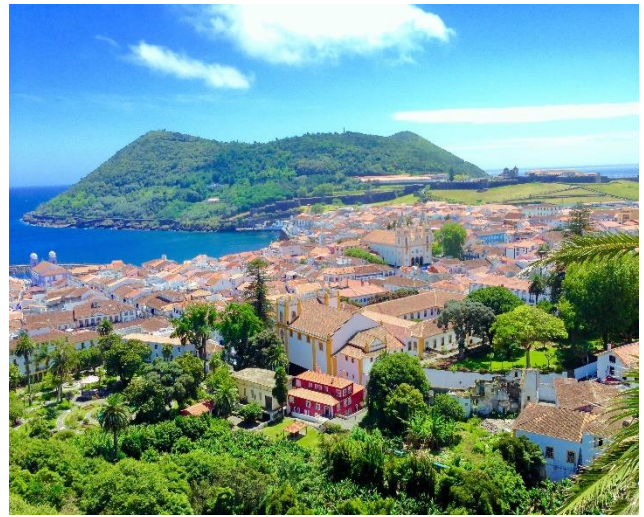
Angra do Heroísmo on Terceira Island