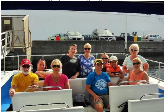
Heading out to sea for whale watching