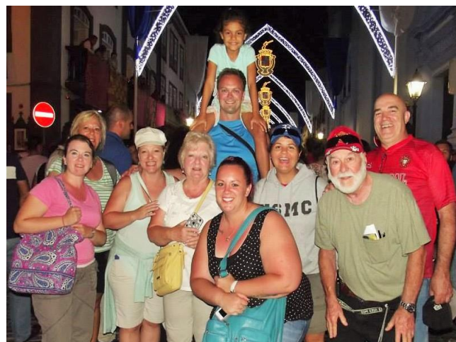
Enjoying the St. John's Festival in Angra