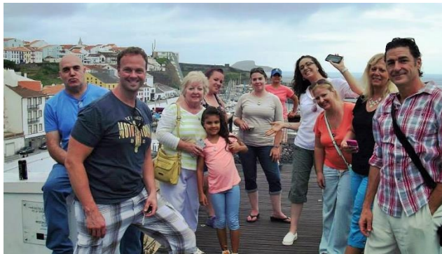
The tour group overlooking Angra do Heroísmo