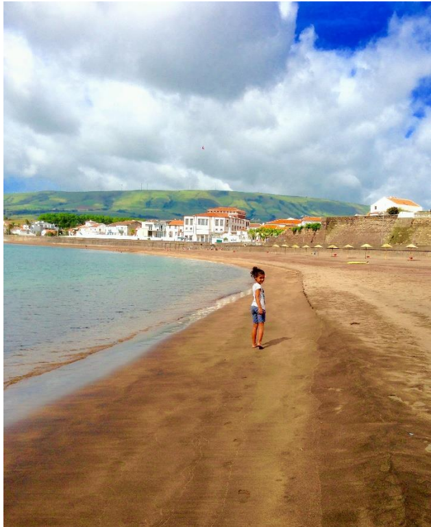
Beautiful beach on Terciera Island