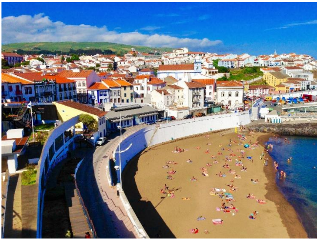
Overlooking Angra do Heroisma on Terceira Island