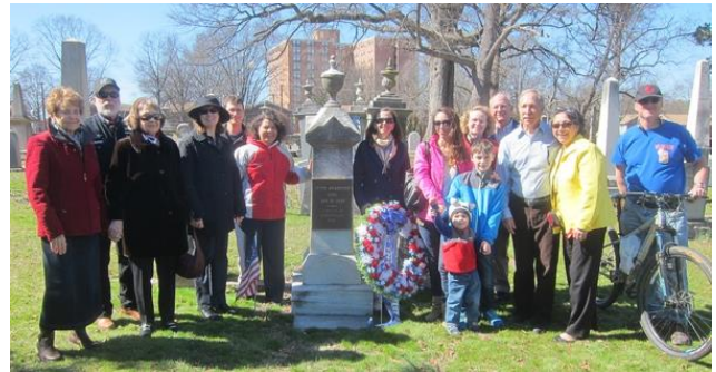
Members at the wreath-laying ceremony after the March meeting

resolutions from New Jersey, New York, North Carolina, Pennsylvania, and Virginia, commemorating Peter's arrival in America and recognizing March 15 as Peter Francisco Day, were presented, and Peter's obituary, "Honor to the Dead" – dated Thursday, January 20, 1831, from "The Richmond Enquirer" – was read. Following the meeting, a wreath-laying ceremony was held at Peter's gravesite in Shockoe Hill Cemetery.