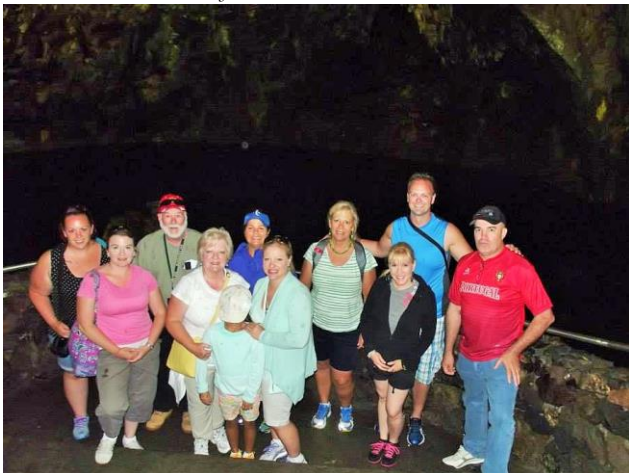
The lake at the bottom of the Algar do Carvão volcano