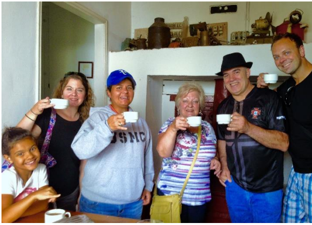
"Tea tasting" at the Chá Gorreana tea factory on Sao Miguel Island