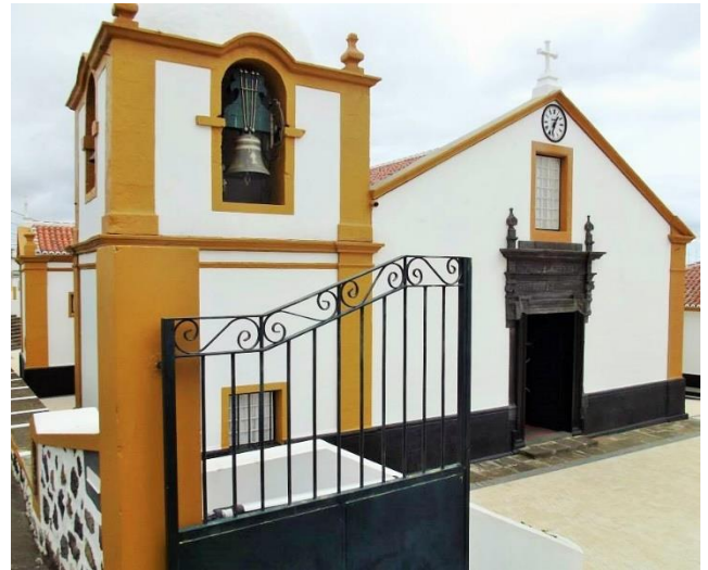
The church in Porto Judeu where Peter Francisco was baptized