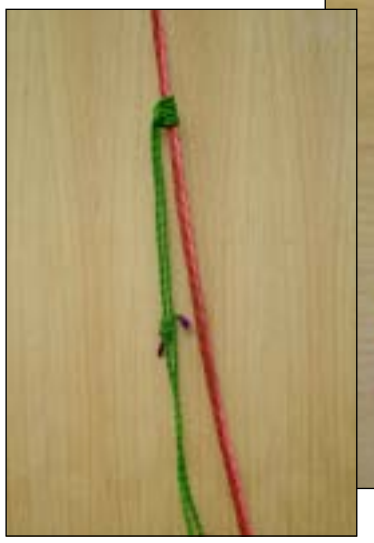
Figure 2.... or as a "closed" climbing hitch. The open and closed versions respond differently, and some consider the open and closed versions to be two different knots.

Figure 3. When using the Schwabisch, the primary gripping takes place in the top of the knot. The Schwabisch should be tied so that the majority of the coils are in the top of the knot.