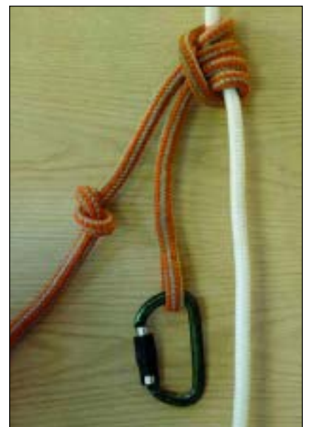
Figure 1. The form of the Prusik can be tied as either an "open" climbing hitch. . .

After some correspondence, it was determined that the first edition of On Rope describes and illustrates the knot correctly. In the new revised edition, however, there was a mistake in both the text and the line drawings. The text incorrectly describes where the primary gripping takes place, and the line drawings show the knot upside down.