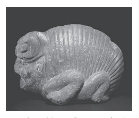
19.5A. Flea with human face. Brownish-red volcanic stone; 30 \times 22.4 \times 45.5 cm.