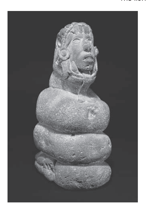
19.2A. Coiled rattlesnake with human face emerging from mouth. Dense gray volcanic stone; 47.7 \times 19.8 \times 26.7 cm.