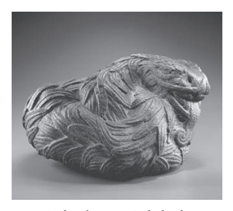
19.4A. Feathered serpent. Pinkish volcanic stone; 30 \times 54 \times 54 cm.