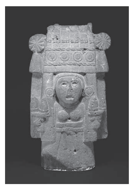
19.3A. Chicomecoatl, goddess of maize and of all vegetable food. Grayish volcanic stone; 63.5 \times 35 \times 18.2 cm.