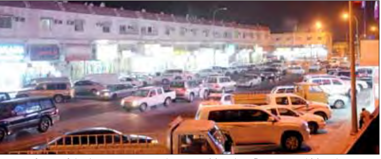
A view of one of the busy commercial areas in Muaither. Rayyan and Muaither are a hub for commercial activities in the evenings.

According to a Rayyan restaurant operator, who has outlets in at least two different locations in Doha, the twin towns of Rayyan and Muaither are livelier in the afternoons and in particular late in the evening than other places in the country, including Doha. "The opening of a number of large shopping centres in areas coming under Rayyan in the last few years itself indicates the businessmen's rising confi-