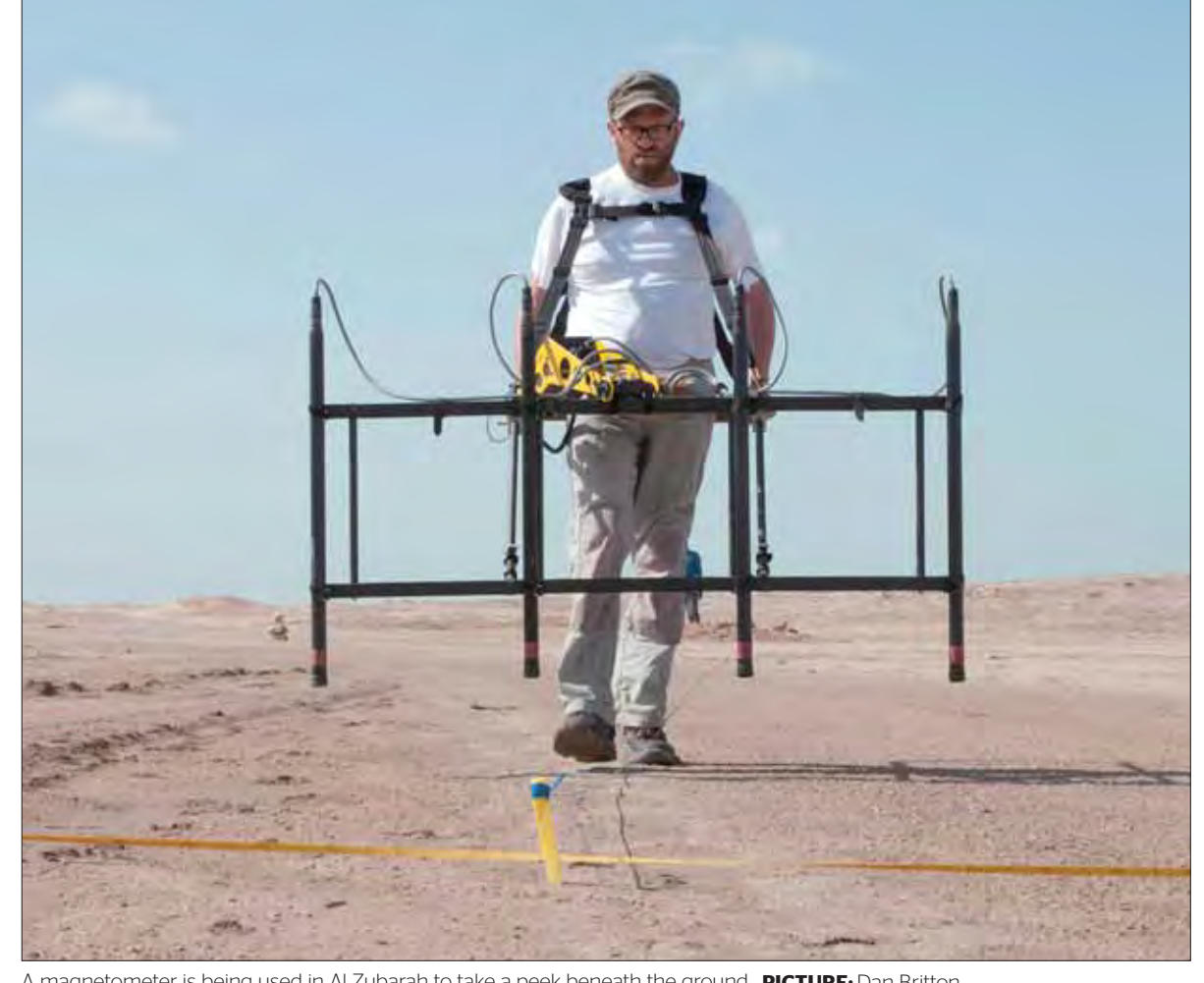
A magnetometer is being used in Al Zubarah to take a peek beneath the ground.