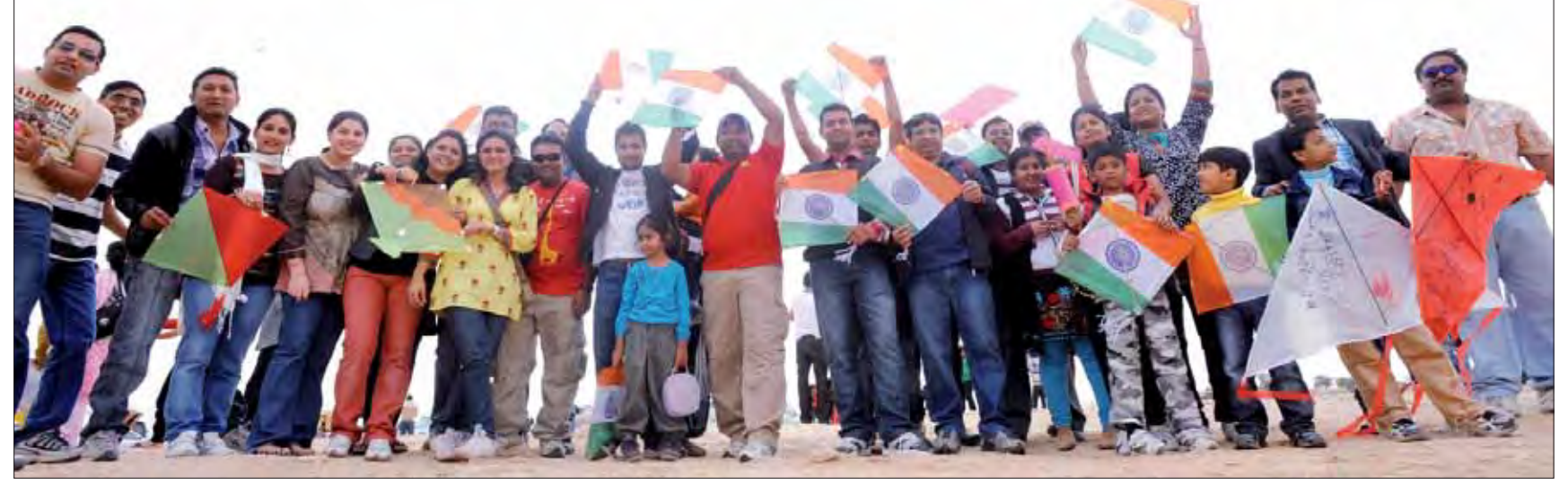
A group of participants display their kites at the festival.