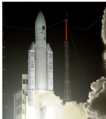
N-STAR c was launched aboard an Ariane 5 rocket.