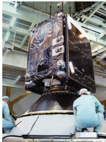
N-STAR c mated to Ariane 5 prior to its July 5, 2002 launch