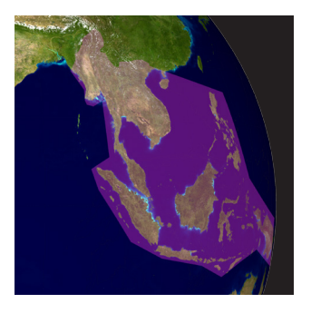
C2 Beam Coverage Contour Map