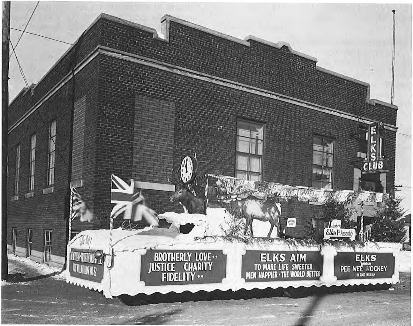
Original Elks Lodge #82, Fort William, Ont. (1928).

for many years. Lodge #82 hosted its 1st Grand Lodge Convention in 1942, again in 1951, then 1963 and 1968.