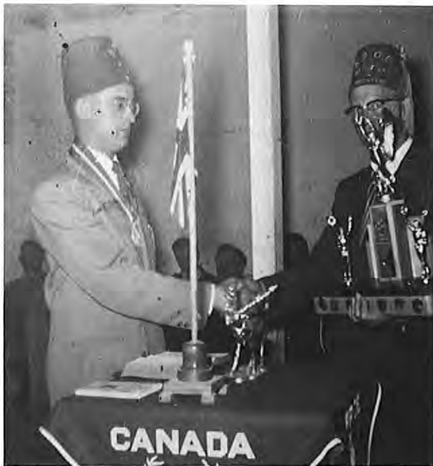
Glaslyn, Sask. Lodge #368. Bateman Trophy for most active lodge.

Some of the earlier projects were: 1) Sponsoring Mighty-Mites, Bantam and Junior Hockey teams, 2) Glaslyn-Fairholme local crests and ribbons for Field Meets, 3) Christmas Hampers for the needy families, 4) Sponsored a Joint Sports Day with the North Battleford Lodge at Little Loon — later an Invitational Golf Tournament held at Little Loon Regional Park, 5) Sponsored Wheat Queen's and Winter Ice Carnival Queens, 6) Helped out destitute families who had lost their homes in fires — this is a continuing project, 7) Sponsored swimming lessons at Turtle Lake, 8) Purchased Ball Equipment for the Bantam League, 9) Elks sponsored a Walk-a-thon