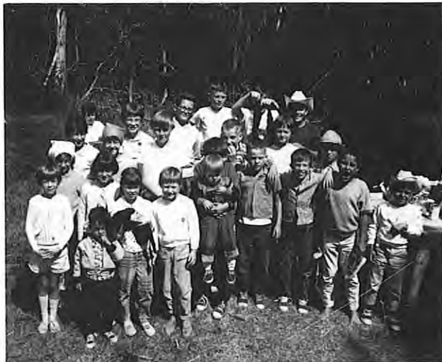
Golden, B.C. Lodge #452. Kids Picnic.