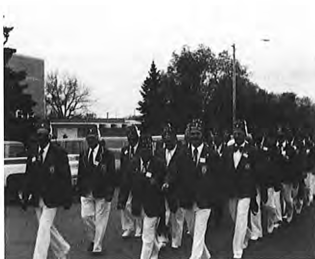
The Walkathon at Indian Head, Sask. Lodge #385 raised almost $32,000.00 in 1980.

The first project undertaken by the Elks was a Kiddies Play Park. The Park, which was finished in 1959, is complete with a paddling pool, change house, swings, teeter totters, slides, etc. In later