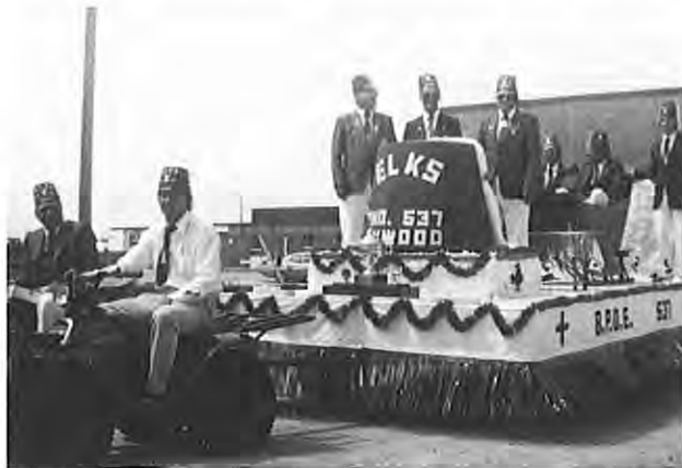
Inwood, Man. #537. Members riding their prize-winning float.