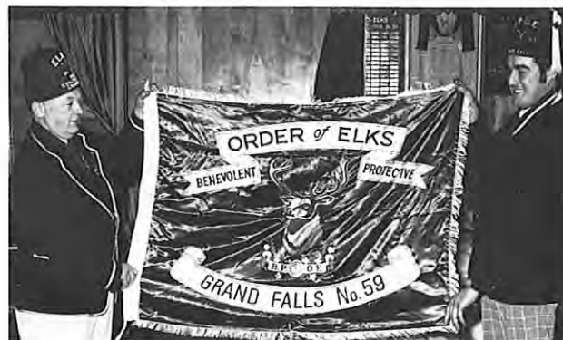
The Lodge Flag.