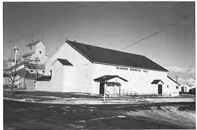
Granum, Alta. Lodge #109. (the original Hall) Where Granum meets today.

money raised was used to build a playground. They next established an Elks Night on March 17. This is still held in the Blunden Hall. The Elks Night has been highlighted by some unusual decorations like a waterwheel with running water and a ferris wheel with each seat containing dressed dolls. Other community projects receiving the assistance of the Lodge have been the Community Hall, Sports Teams, Cubs and Scouts, Brownies, The Granum Library and a Drop-in Center. The Lodge continues to remain active, canvassing for the Canadian Cancer Society, building ball diamonds and assisting the community after the two major fires which struck the town.