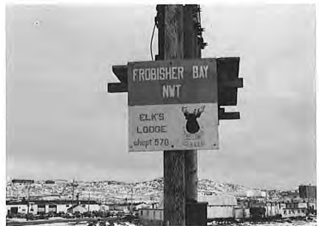
Frobisher Bay, N.W.T. #570. The Lodge Sign at the airport.