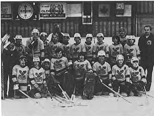
Elks support young Hockey Stars, Geraldton, Ont. #354.

comes every year for the kids. Their interest in hockey for the youngsters knows no bounds, entering their teams in inter-lodge and district tournaments, as well as the central Canada Pee Wee Hockey tournaments in Thunder Bay. Money is raised in the sale of hockey pool tickets, bingo, raffles, etc. and a pledge to the Geraldton District Hospital of $3000.00 was fulfilled in 1984. This Lodge is a fine example of the smaller lodges doing big work.