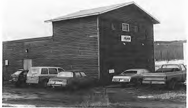
Houston, B.C. Lodge #533. Their new Home.