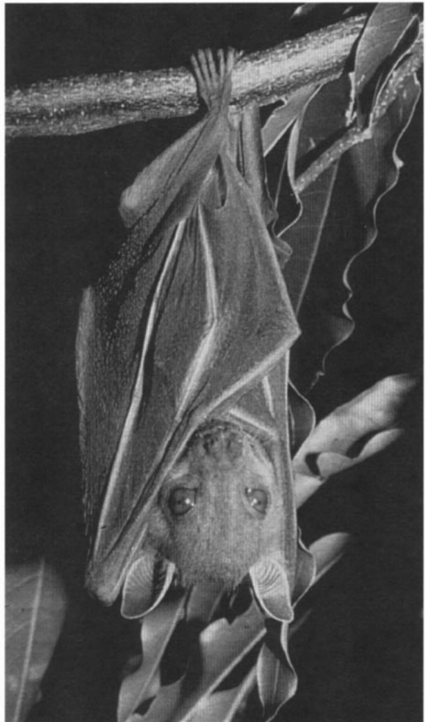
FIG. 1. Adult male Cynopterus sphinx in Kuttalam, India.

In areas of sympatry throughout the Indomalayan region, C. sphinx can be distinguished from congeneric species on the basis of forearm length and condylobasal length, respectively (measurements, in mm): 66–78, 29–35 ( C. sphinx ), <67, <29.5 ( C. brachyotis ), 64–89.5, 29–37 ( C. horsfieldi ), and 73–83, 34–37 ( C. titthaechileus ; Corbet and Hill, 1992). In areas of sympatry in southern India and Sri Lanka, C. sphinx can be distinguished from C. brachyotis on the basis of four characters (mean and range, in mm): length of forearm, 70.2 (64–79), 60.3 (57.3–63.3); condylobasal length, 30.9 (28.4–33.3), 27.6 (26.0–28.8); length of maxillary toothrow, 11.1 (10.2–12.2), 9.7 (8.9–10.7); and length of ear, 20.6 (17.5–24.0), 16.7 (14.5–18.0—Bates and Harrison, 1997). Also, the ears of C. sphinx are larger and are characterized by pale anterior and posterior borders; the ears of C. brachyotis are smaller and have more poorly developed borders (Bates and Harrison, 1997).