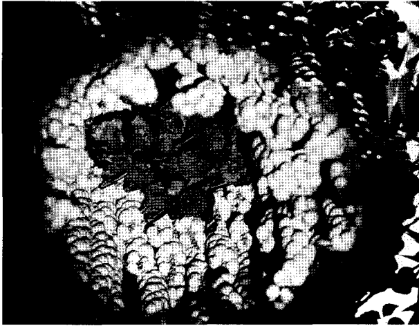
FIG. 4. Harem social group of Cynoptyerus sphinx roosting in the modified crown of a fruit cluster of the kitul palm, Caryota urens , in Pune, India.

benghalensis ), tree hollows, and tree foliage (Advani, 1982b; Bhat, 1994; Brosset, 1962; Khajuria, 1979; Sandhu, 1984; Sinha, 1986). It occasionally roosts under the eaves of houses and buildings and less frequently in ruins and caves (Bates and Harrison, 1997; Bhat, 1994; Prater, 1971). C. sphinx is reported to construct foliage roosts called 'tents' (Balasingh et al., 1993, 1995; Bhat, 1994; Bhat and Kunz, 1995; Goodwin, 1979). Within the suborder Megachiroptera, tent-making behavior has been reported only in the genus Cynoptyerus (Kunz et al., 1994).