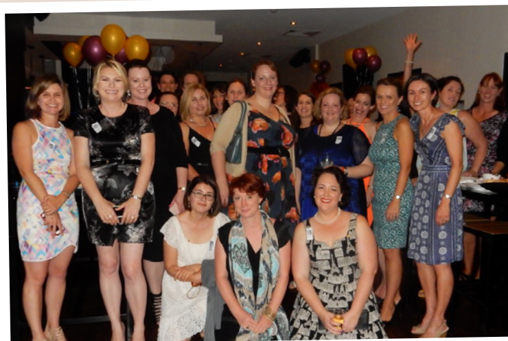
20 Year Reunion