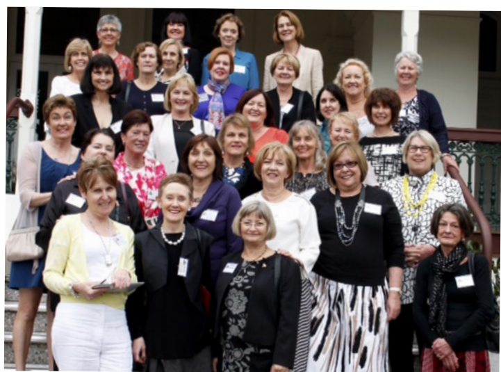
40 Year Reunion