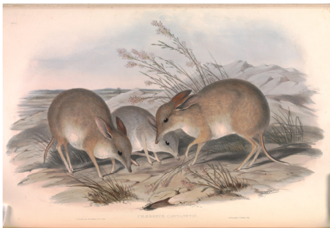
Pig-footed Bandicoot (J Gould © Museum Victoria)

The pig-footed bandicoot was a small bandicoot (weight about 200 g), with delicate and graceful appearance. Its ungainly name refers to its forefoot, which had only two functional toes, with hoof-like claws. It had unusually long legs for a bandicoot, and moved distinctively (“like a broken-down hack”). Its fur was orange-brown above, and lighter fawn below. Its ears were relatively long (though shorter than those of bilbies).