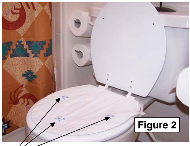
Apply Velcro pieces at top and sides. Then expose sticky side of other Velcro half and lower the lid.