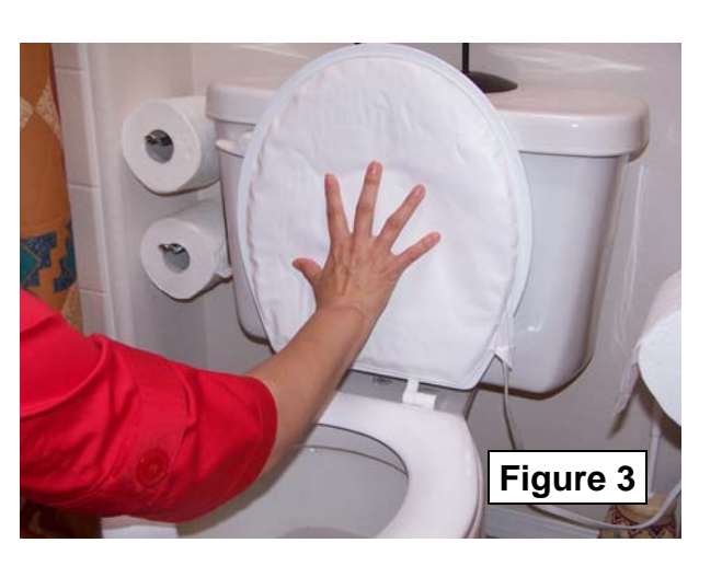
Raise lid & press for adherence.