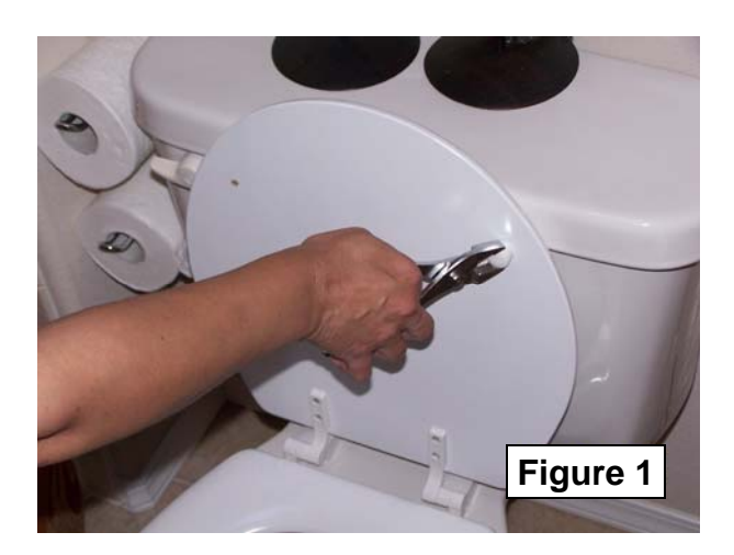
Twist and pull out removable plastic spacers on lid.