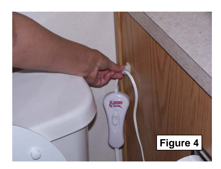
Position hangar on porcelain, Cabinet, or wall as desired.