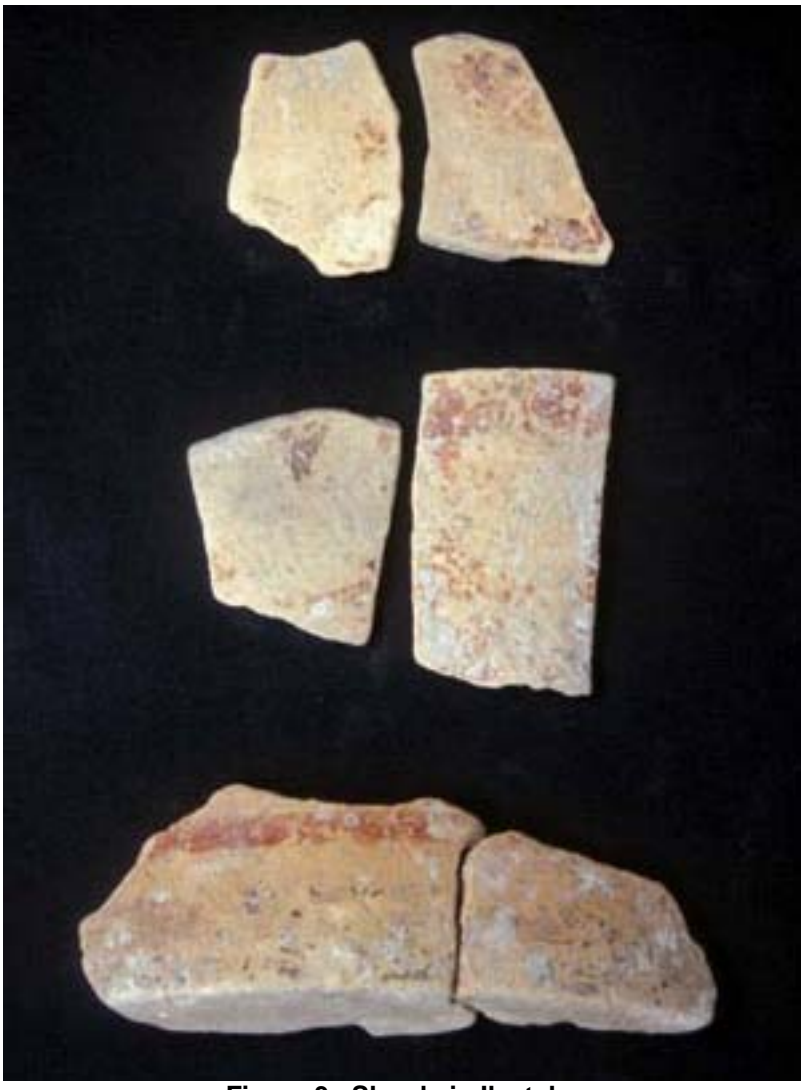
Figure 3. Sherds in lk style.

Pottery analyzed from operations MSJ15, MSJ29, and small test-pitting operations in the plaza groups of the northern zone of Motul mostly date to the Late Classic period, as expected. However, one group had a substantial Early Postclassic component in the midden located behind one structure. We were also able to better define the Terminal Classic ceramic assemblage at Motul de San José through the latest excavations of Group D and the analysis of its pottery. Typical of the Terminal Classic at Motul are: rare polychromy, accompanied by an increase in the use of incised and carved-incised orange- or red-slipped serving ware; red-slipped large jars with everted rims; red-slipped jars with bulging, tall and relatively vertical necks.