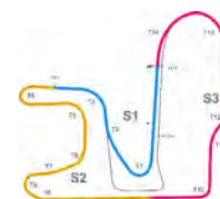
Beijing Goldenport Circuit