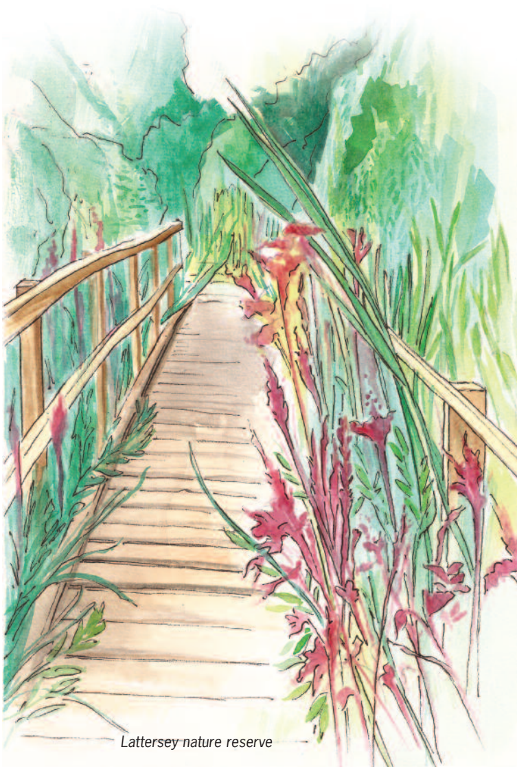
Lattersey nature reserve

Following grassy droves this route takes you on a walk through the history of this evocative part of the countryside, where you will see medieval and modern industry tempered by nature to produce a distinctive and attractive fenland landscape.