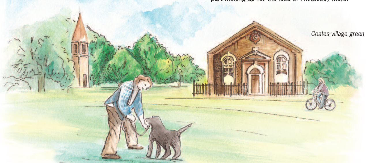
Coates village green

Lying to the north of Whittlesey, the Nene Washes comprise a large area of open land created as a result of the drainage of the surrounding fenland for agriculture in the 17th and 18th centuries. The land serves as the flood storage area for the River Nene. The combination of grassland and the wetness make the Washes a great place for wildlife. Important numbers of wildfowl over winter here including Bewick swans from Russia and Whooper swans from Iceland. The Washes are some of the best floodplain meadows left in England and support a significant proportion of the country's nesting black-tailed godwit and snipe. In addition to farming and wildlife, the washes are used for skating, wildfowling and fishing, in part making up for the loss of Whittlesey Mere.