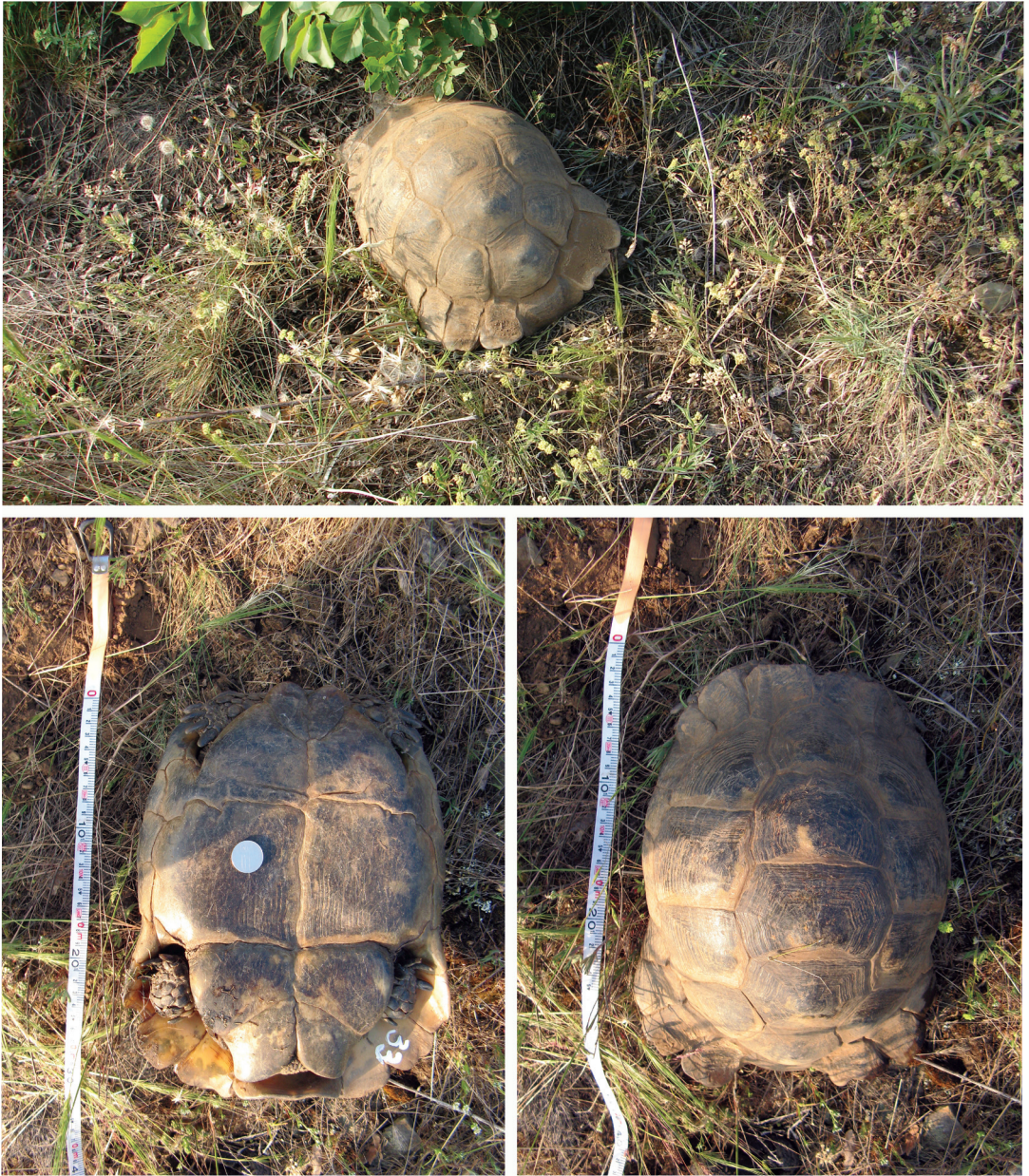
Figure 2. The large male found on May 15, 2009 in Măcin Mountains National Park.

having a straight carapace length of 30.5 cm and a body weight of 3.6 kg. Since females are larger than males in spur-thighed tortoises (Carretero et al. 2005; Willemsen and Hailey, 2003) we expect that even larger females may occur in the wild.