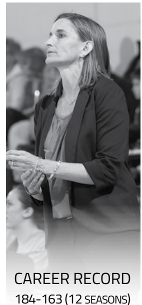
CAREER RECORD 184-163 (12 SEASONS)