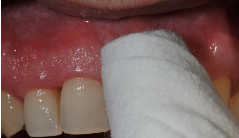
Figure 1. Clinical use of a novel oral care device for plaque removal.