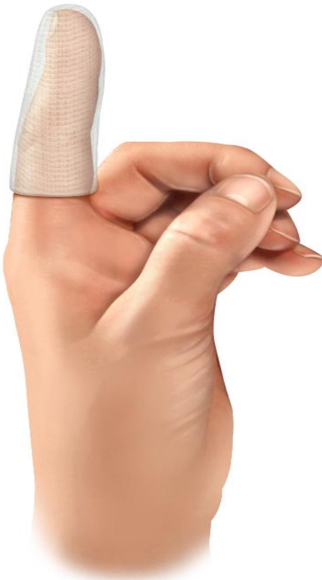
Figure 2. Drawing of the Digital Brush (Enacare, Micerium S.p.A., Genoa, Italy), a disposable gauze product containing 0.12% chlorhexidine. This device can be utilized as an alternative tool when conventional oral hygiene is unfeasible or as an additional method to improve the efficacy of self-performed mechanical biofilm removal.

manual toothbrushing in the general (young and middle-aged) healthy, nondisabled population, as reported in a meta-analysis (van der Weijden GA, Hioe, 2005). Consistently, no more than 60% of the overall plaque is removed during each episode of cleaning (Claydon, 2008). Less plaque was removed from mandibular teeth and lingual tooth surfaces than on the maxillary teeth and buccal surfaces (Claydon, 2008; Yuen et al., 2009).