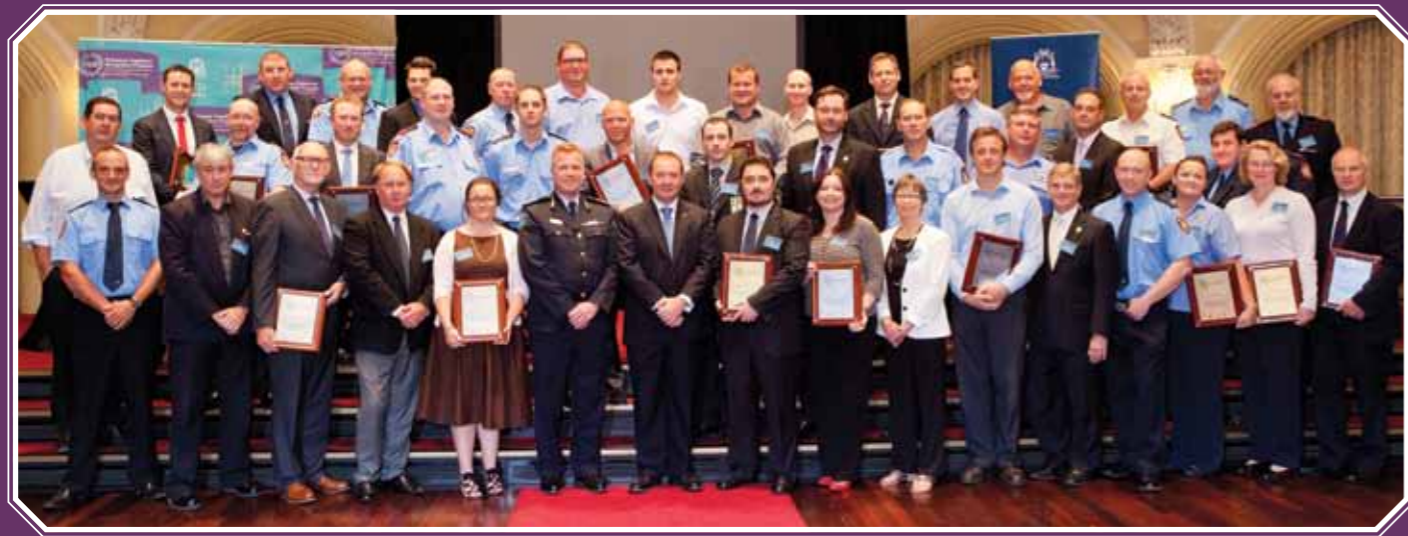
2013 Volunteer Employer Recognition Program award recipients and nominators at Government House Perth with Fire and Emergency Services Commissioner Wayne Gregson APM and Emergency Services Minister Joe Francis MLA (centre front).