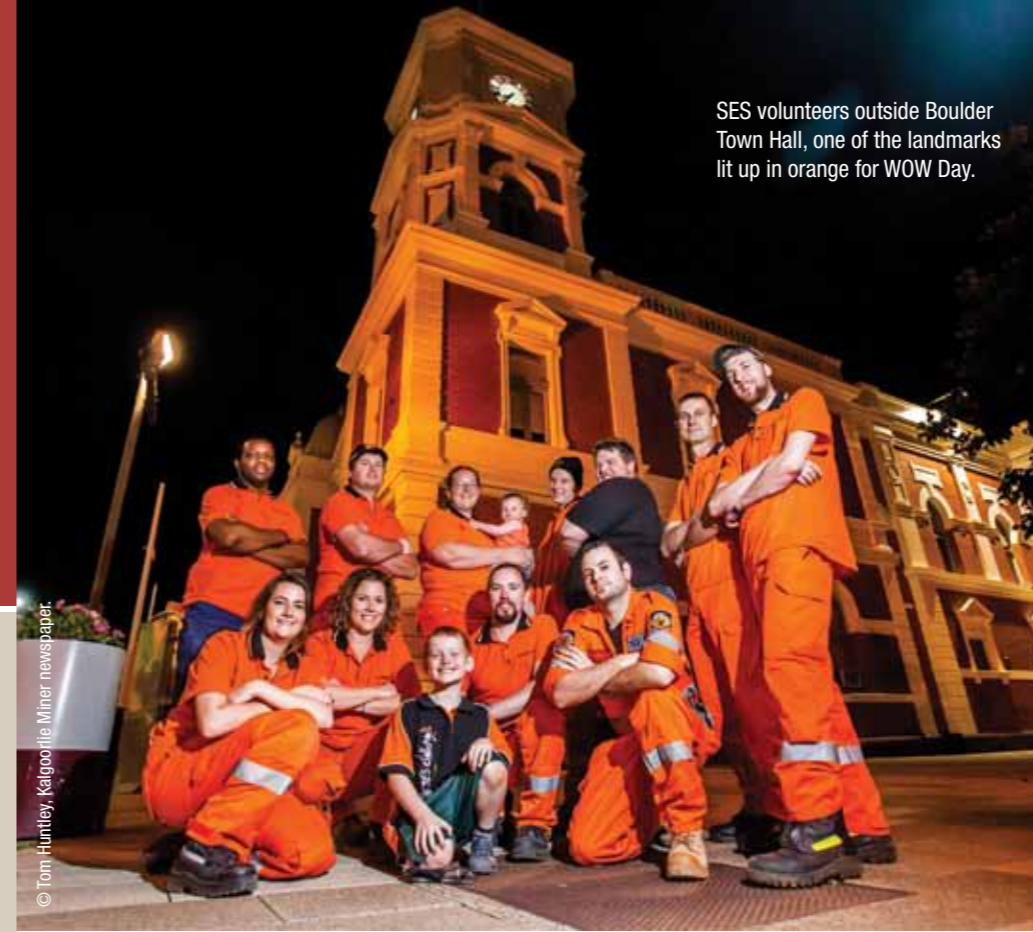
SES volunteers outside Boulder Town Hall, one of the landmarks lit up in orange for WOW Day.

“SES Week and WOW Day are co-ordinated by DFES to publicly thank the SES for continuing to offer their time and put the needs of others before their own.”