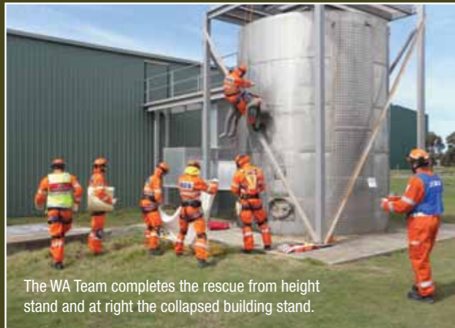
The WA Team completes the rescue from height stand and at right the collapsed building stand.