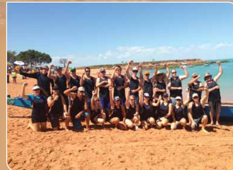
The combined Broome Volunteer Fire and Rescue Service and Bush Fire Service team enjoy the dragon boat regatta.

“We all enjoyed participating and were pleased with our second prize of a dinner out for team members.”