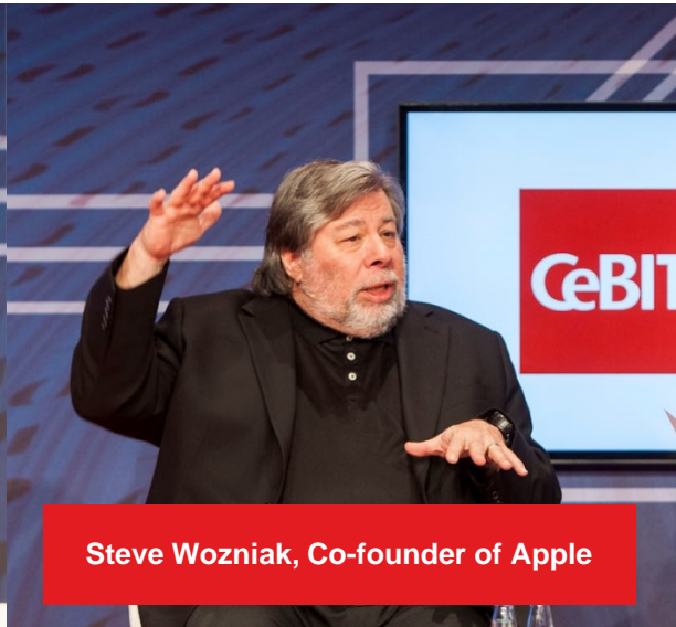
Steve Wozniak, Co-founder of Apple