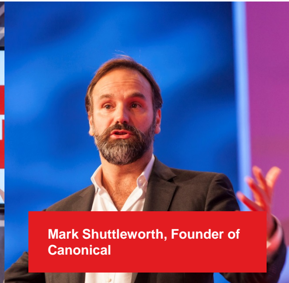
Mark Shuttleworth, Founder of Canonical