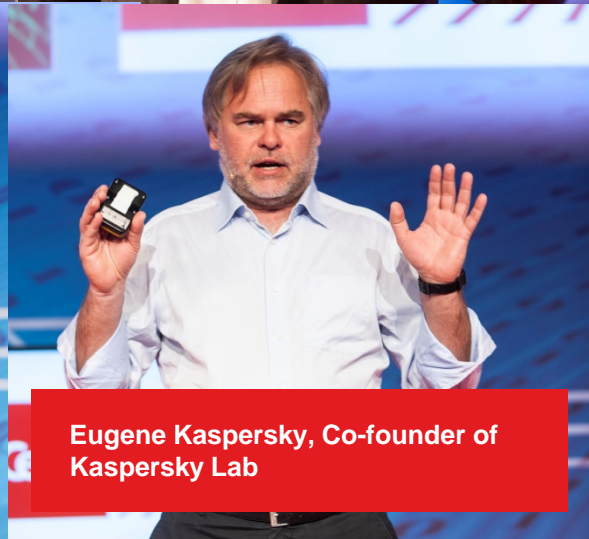
Eugene Kaspersky, Co-founder of Kaspersky Lab