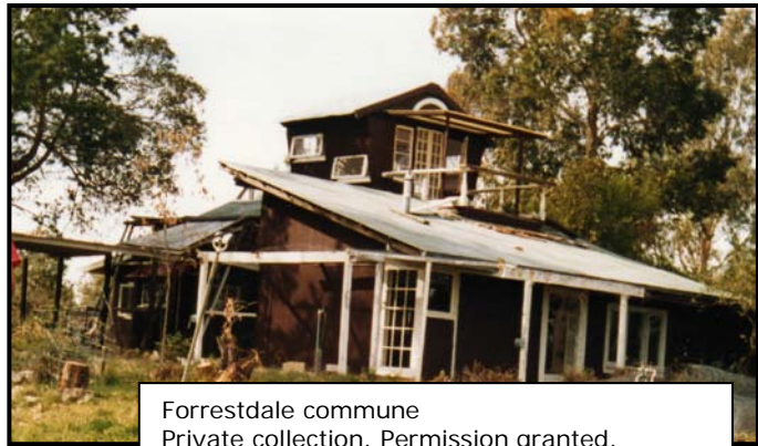
Forrestdale commune