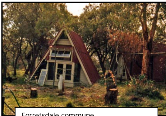
Forretdale commune