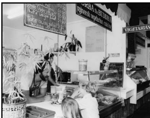
Zorba the Buddha restaurant. Private collection. Permission granted.

Several months after the renovation of the Oceanic Hotel, a decision was made to