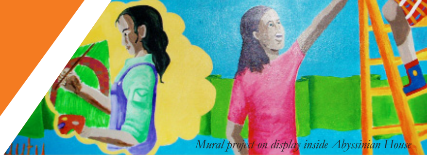
Mural project on display inside Abyssinian House