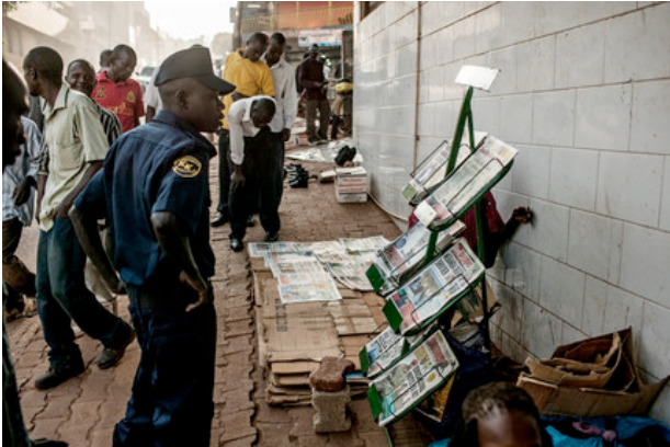
A Ugandan man reads headlines at a newspaper stand in downtown Kampala, 3rd June 2013. In the past, tabloid newspapers have advocated violence against LGBTI people and printed information about people suspected of being homosexual.