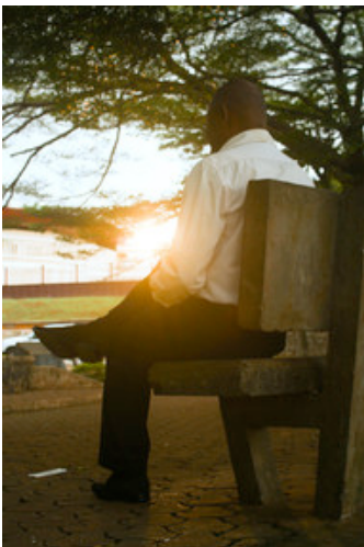
Cameroon, May 2013. A man who was imprisoned in 2005 for 13 months, accused of homosexuality with other men. Whilst in prison, he was subjected to homosexuality tests. The charges were eventually dropped, and when he was freed he engaged in LGBTI human rights defense work.