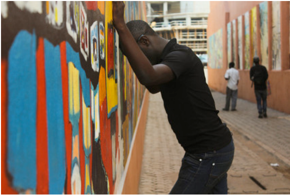
Downtown Yaoundé, May 2013. A young man who has been frequently beaten in his neighborhood and evicted from his home, because of his sexual orientation and gender identity.