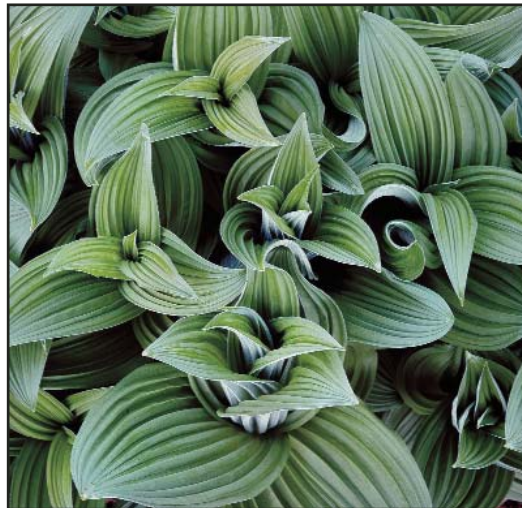
Swirling Veratrum, Alaska

Nevertheless, while the natural world is filled with beauty, life and wonder, it still pales by comparison with the depth of beauty contained within the Orthodox Church and our church sacraments. One of the unique characteristics of the Orthodox Church is her recognition of the contribution of beauty to our spiritual life. Our homes and churches are filled with Icons and our services incorporate the use of priestly vestments, chanting and singing, processions, incense, candles, and precisely choreographed sacraments. Beauty is an integral and vital part of our Orthodox worship.