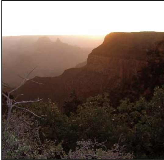
Dawn at the Canyon

Often they are there before our eyes and all that is required is the right commitment or concentration of time. Several years ago when visiting the Grand Canyon with my wife, the question was raised as to the best time for taking pictures. For some, there is a particular moment which they only will recognize, and for which they will wait hours or days. For others like me, there was an urge to be present at particular times – at dawn or sunrise. Given a fire across the rim