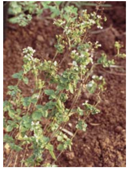
Origanum vulgare subsp. hirtum 'Chef's Greek' (culinary).