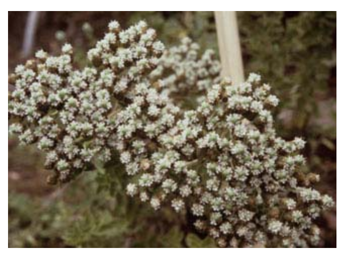
O. onites.

Scent/Flavor: hot, peppery and thyme-like