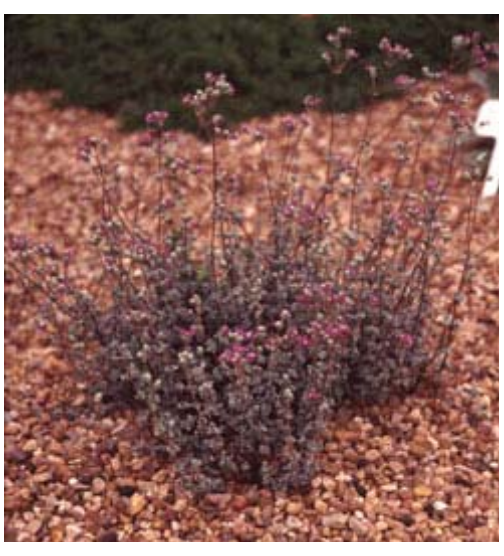
O. microphyllum.