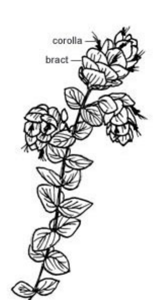
O. rotundifolium with prominent hop-like bracts

All members of the genus have flowers that occur in spikes; for most species these form a panicle with multiple branched stems growing from a central stalk. In O. onites, the spikes grow in a "false corymb" (56), forming a convex or flat-topped open inflorescence (102). Corollas may be purple, pink or white depending on the species. In some species flowers are arranged in whorls. The calyx, or small vase-like receptacle that supports and protects the corolla and reproductive organs of the flower, can be bell-shaped or tubular (97) with one or two lips (56). The shape of the calyx is the principal plant character used to distinguish between Origanum species