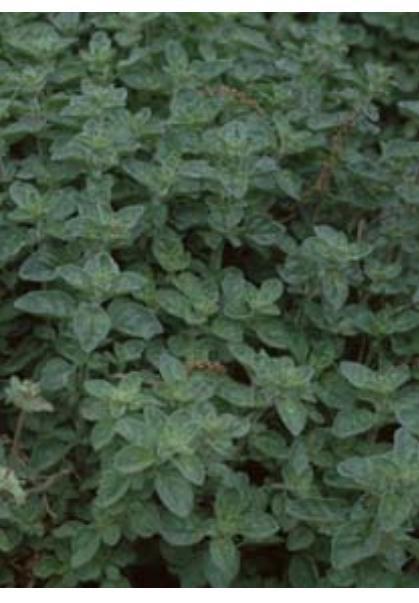
O. xmajoricum.