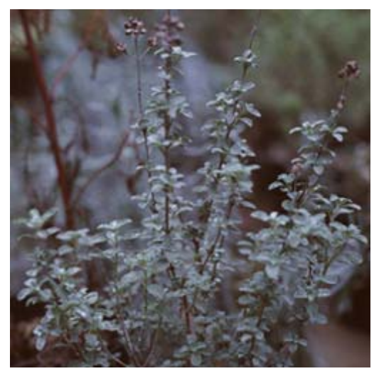
Origanum 'Kaliteri' (syn. O. 'Kalitera') (culinary)