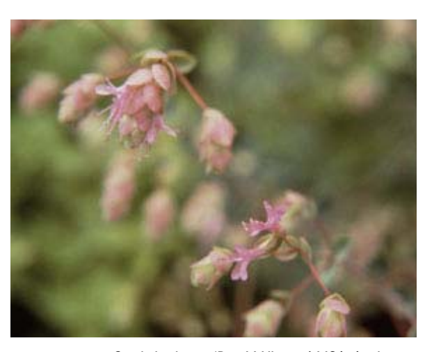
O. xhybridinum 'Ray Williams.'

Uses: ornamental, culinary Scent/Flavor: similar to oregano