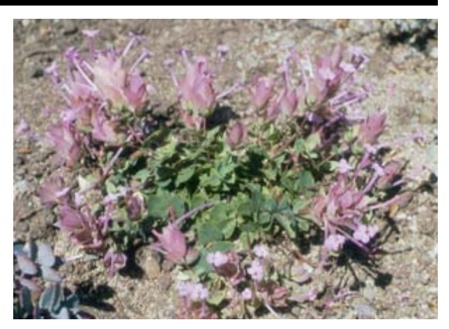
O. amanum.