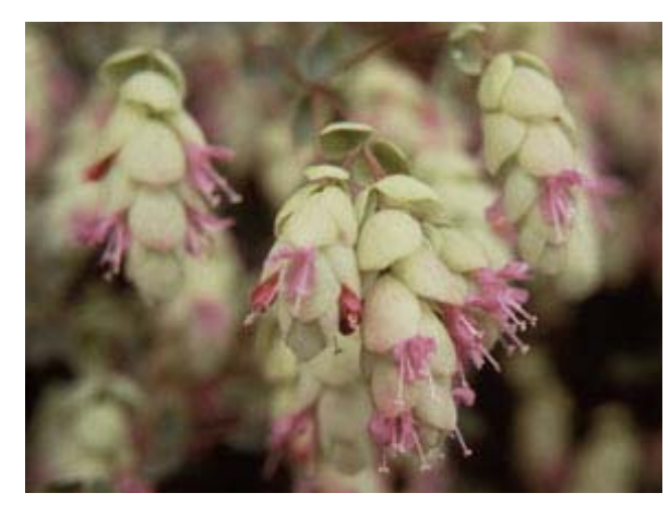
O. libanoticum.

Height: 24" Hardiness Zone: 7 Uses: ornamental