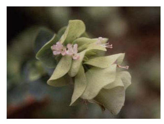
O. rotundifolium.

Hardiness Zone: 7 Uses: ornamental, craft Scent/Flavor: minimal