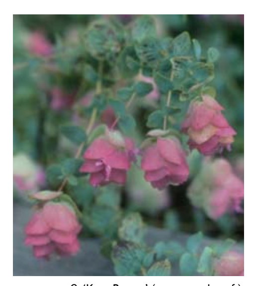
O. 'Kent Beauty' (ornamental, craft)