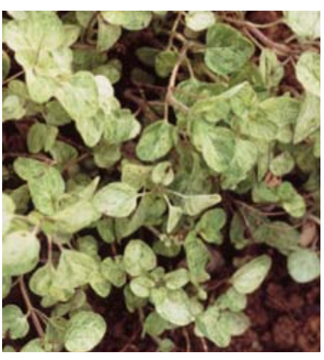
Origanum 'Jim Best' (ornamental)