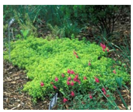
O. vulgare subsp. vulgare 'Aureum' (ornamental)