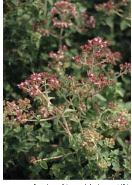
O. vulgare 'Yunnan' (culinary, HSA Promising Plant.).