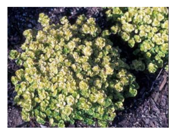
Origanum vulgare subsp. vulgare 'Dr. letswaart' (ornamental).