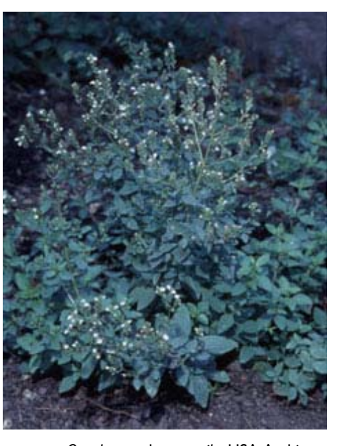
O. vulgare subsp. gracile.

Sources for Profiles: (7, 11, 16, 18, 32, 51, 55, 56, 92, 101, 102, 104, 105, 113)