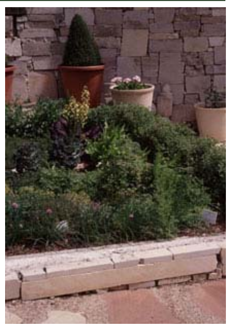
Origanum xmajoricum border (right and back).

A practical use of origanums in the landscape is for erosion control. O. vulgare subsp. vulgare can be grown on hillsides to prevent erosion, and Tina Marie Wilcox likes to plant it on the roof of her root cellar to hold the soil in place (114).