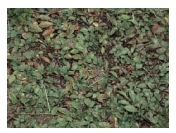
Origanum vulgare subsp. vulgare 'Humile' (ornamental, culinary).