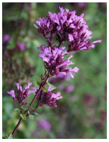
Origanum 'Herrenhausen' (ornamental, craft).