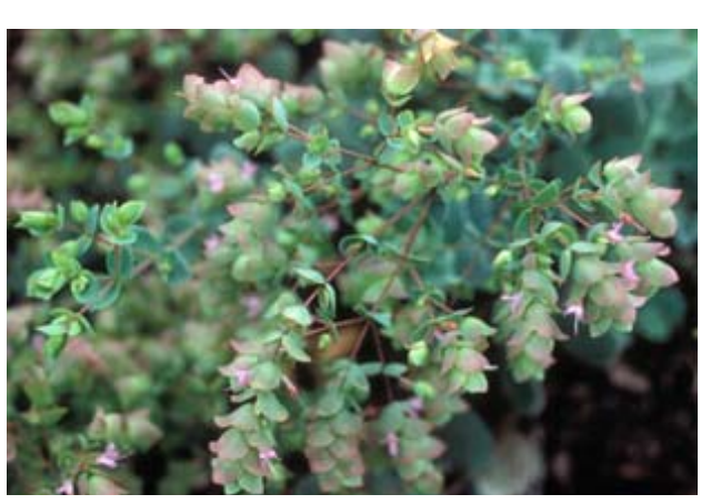
O. dictamnus.

Uses: culinary, medicinal, economic Scent/Flavor: menthol, camphor, medicinal