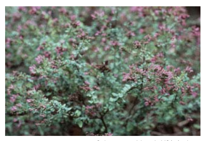
O. laevigatum (above). HSA Archives

Bract Color: purple Height: 20-28" Width: 18" Hardiness Zone: 7 Uses: craft, ornamental