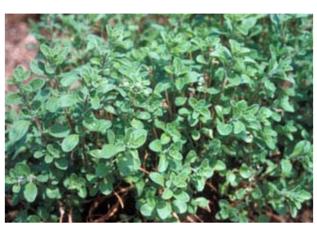
O. majorana.