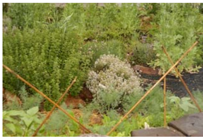
{\it Origanum~xmajoricum~(left)~with~thyme~and~chives}

In the landscape, origanums can be grown in edgings, pots and borders (102) and dwarf, spreading types like O. vulgare subsp. vulgare 'Humile' can be used as groundcovers (78, 104). According to Carol Morse, O. vulgare subsp. vulgare 'Humile' makes a good edible ground cover that can be planted between stepping stones or allowed to grow to 6 inches for wilder or eccentric paths (78).