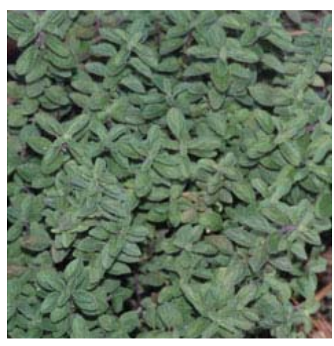
O. xmajoricum 'Hilltop' (culinary, HSA Promising Plant).