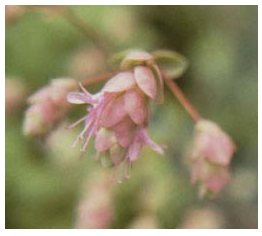
Origanum xhybridinum 'Ray Williams' (ornamental)