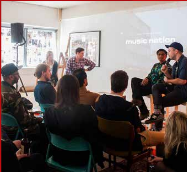
DAZED & CONFUSED