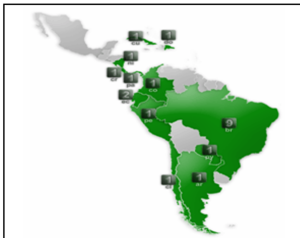
Figure 2: Internet Exchange Points in Latin America, presented by Roque Gagliano, NAPLA.

Implementing and maintaining carrier-neutral facilities can be a costly venture. Cost elements include power, air-conditioning, security, floor space rental, and staffing, among others. Basic membership fees and port charges are usually levied on IXP participants to offset operational costs. It was noted that surplus revenues, which can result from a growth in IXP membership, are often reinvested in facility enhancements and new services.