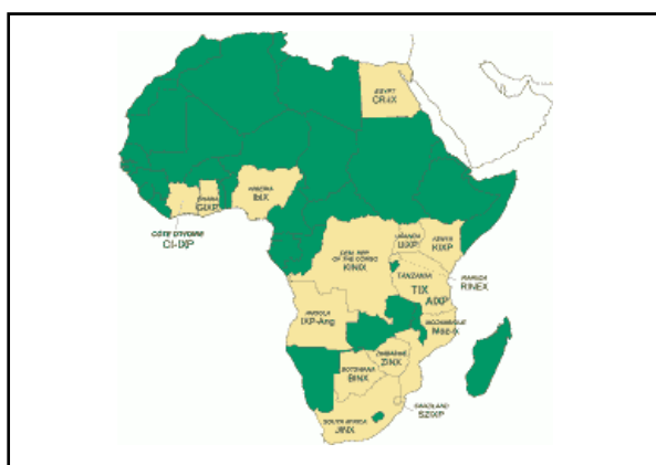
Figure 3: Internet Exchange Points in Africa, presented by Michuki Mwangi (data courtesy the Network Start Up Resource Center)