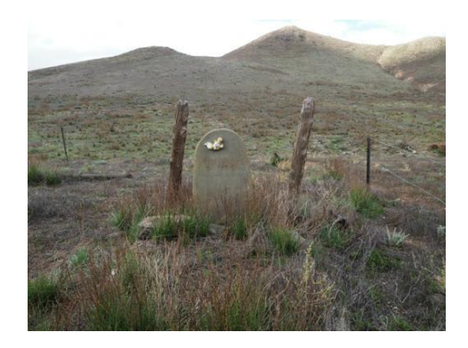
Prince Alfred Copper Mine Precinct, via Cradock – View to north east [Grave of George Whitlock in the fenced cemetery.]