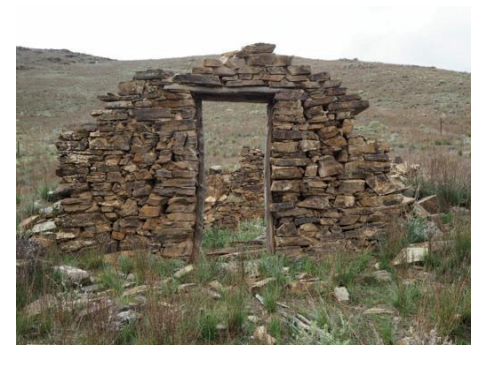
Prince Alfred Copper Mine Precinct, via Cradock – View to north east [House or pub ruin in township.] (DSCN P42490111 J. McCarthy)