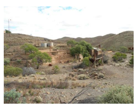
Prince Alfred Copper Mine Precinct, via Cradock – View to north west [1970s leaching plant, showing concrete tri-level layout.] (DSCN 1990 P. Bell)