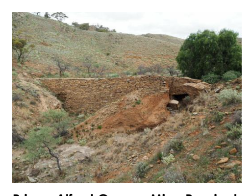
Prince Alfred Copper Mine Precinct, via Cradock [Stone-lined earth dam showing breach at west end. View is of downstream face looking south.] (DSCN P42490115 J. McCarthy)