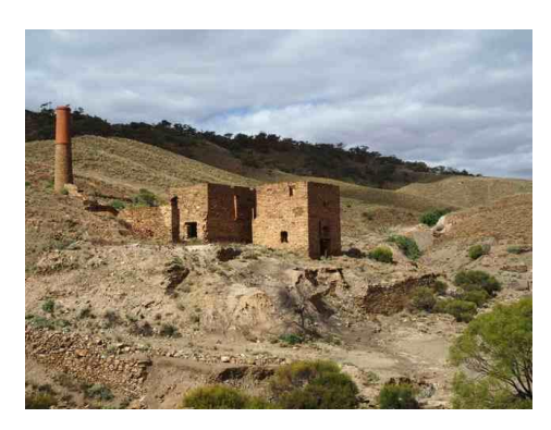
Prince Alfred Copper Mine Precinct, via Cradock - View to south east [Crusher house (right), engine house (centre), boiler house (left) with chimney and flue at rear and remnant drystone walling and tailings in foreground.] (DSCN P42490059 J. McCarthy)