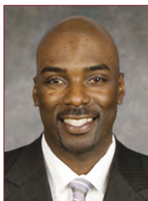
Aaron McKie Assistant Coach Second Season