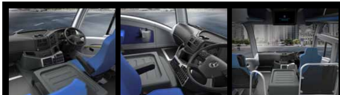
Stylish, refined and insulated cabin

The dashboard and driver's area have been ergonomically designed for optimum comfort and control. Features include cruise control, a colour display for daily check items plus a high quality Bosch audio system and P.A. From the comfort of an air suspension seat, drivers have excellent visibility to the front, sides and rear through electronically operated, heated exterior mirrors.