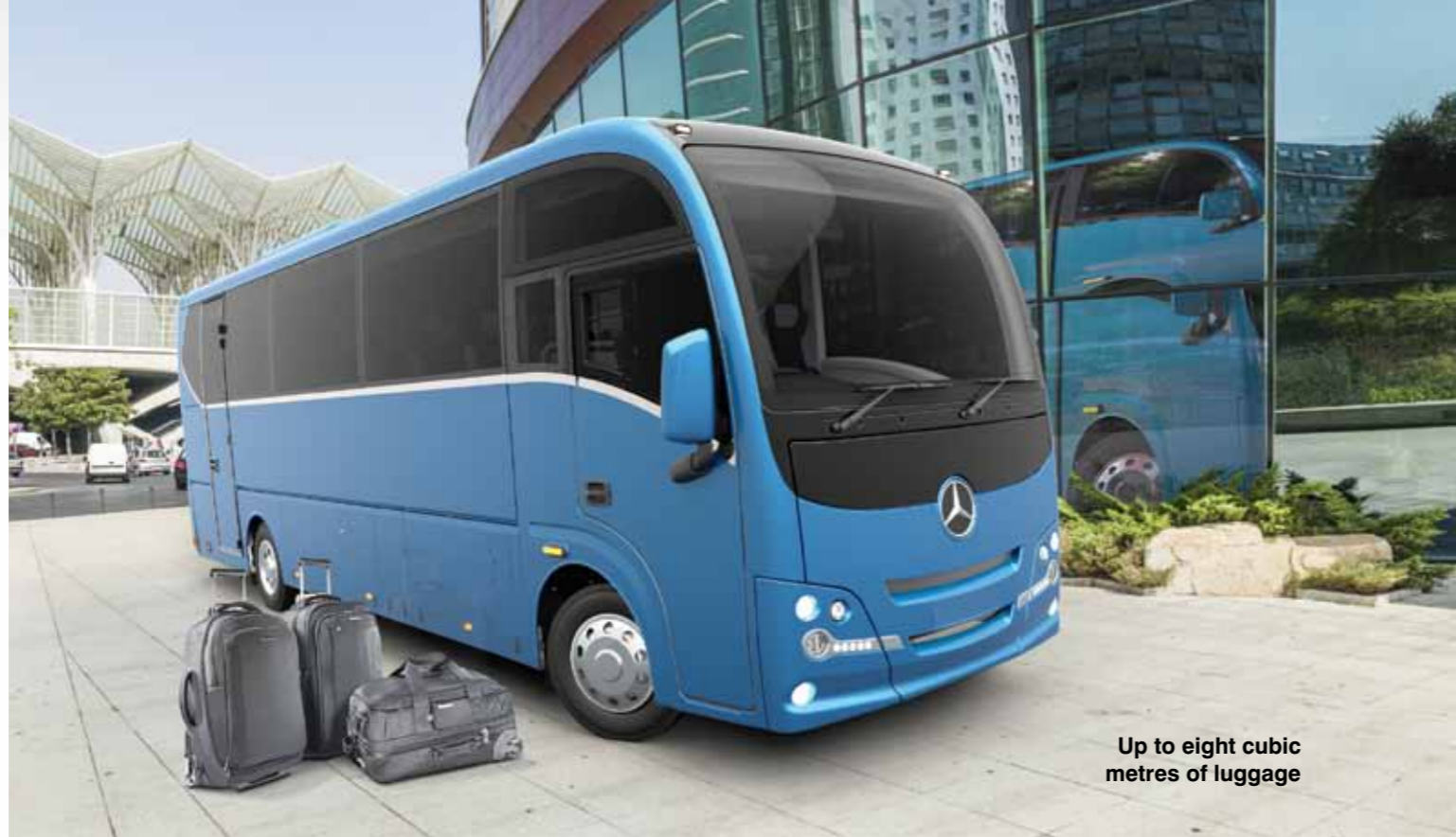
Up to eight cubic metres of luggage