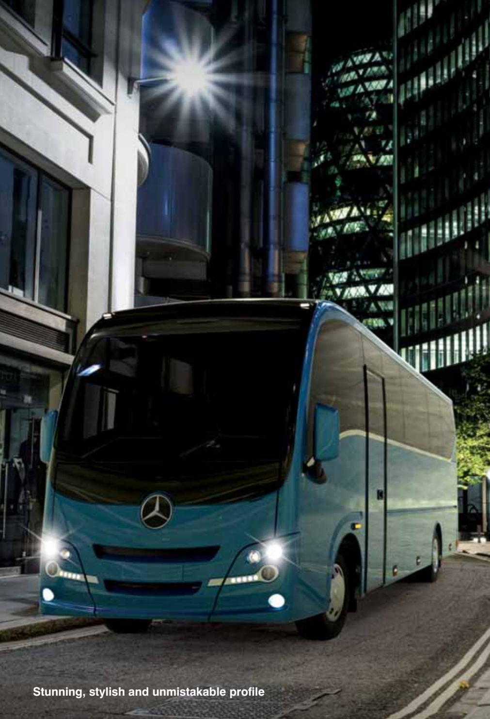
Stunning, stylish and unmistakable profile