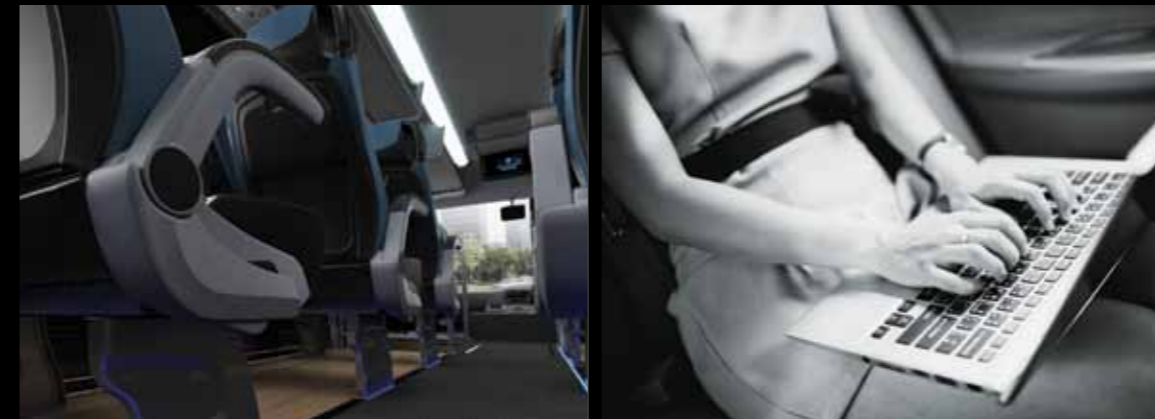
Reclining seats as standard