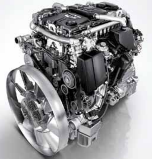
Four cylinder in-line engine that complies with the Euro 6 emissions and meets M3 standard