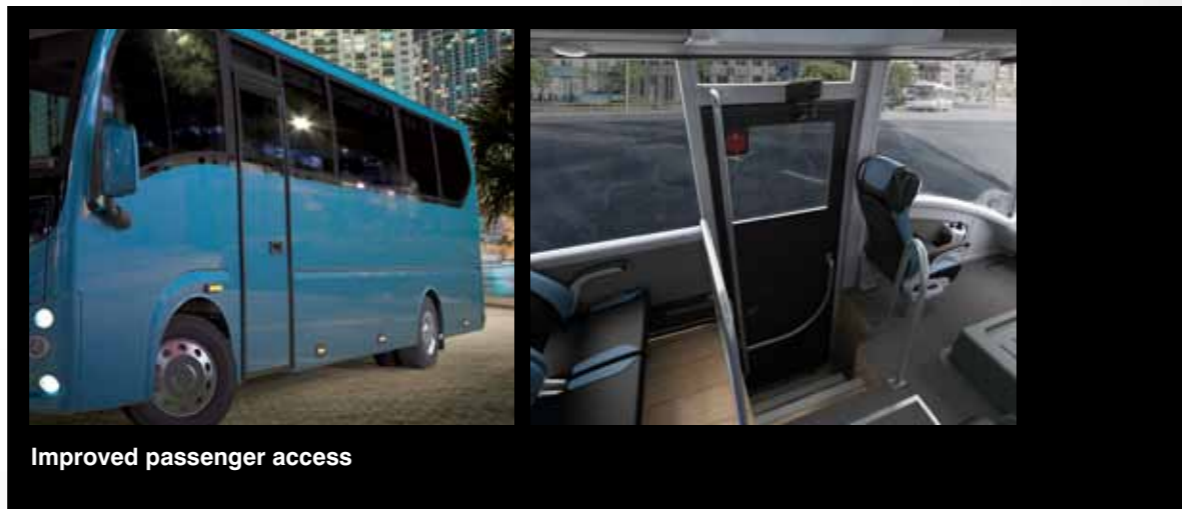
Improved passenger access

The new Cheetah XL offers improved passenger access at the front with an emergency exit door on the rear off-side, featuring a slide out step.