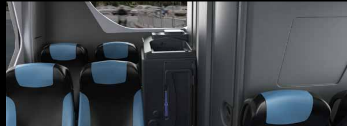
First class travelling environment