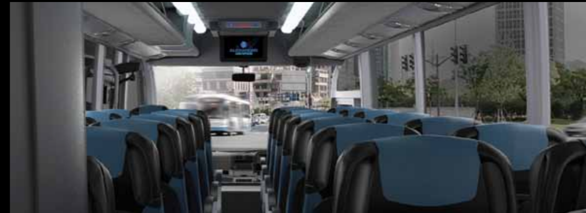
Seating 36 + crew