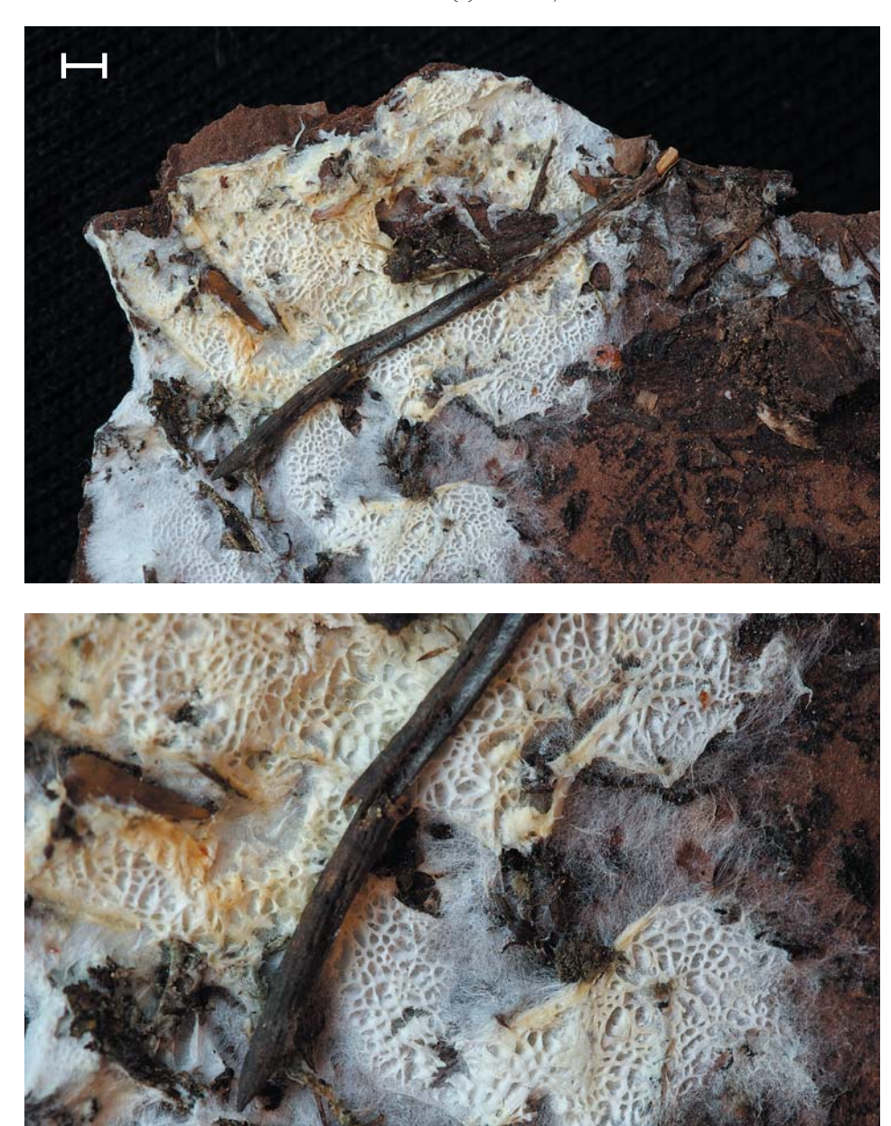
\textbf{Fig. 2.} \textit{Sistotrema dennisii} - \textbf{dried fruitbody stored in the PRM herbarium.} \ \textbf{Bar=1} \ \textbf{mm.} \ \textbf{Photo:} \ \textbf{T.} \ \textbf{Zibar.}