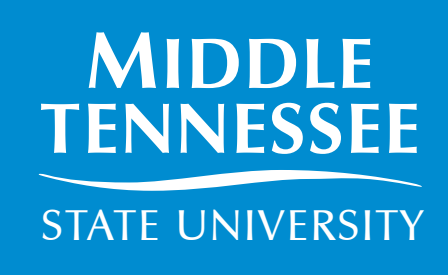
The wordmark can be printed or displayed in white on a solid background. A special mark with adjusted letter spacing has been created for this purpose. Contact Creative and Visual Services for more information.