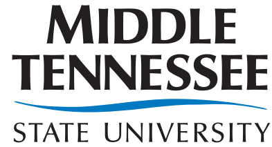
College of Basic and Applied Sciences

The marketing slogan, Tennessee's Best , is sometimes added below the wordmark as shown. Names of departments, colleges, centers, offices, and other units may be substituted in this space.