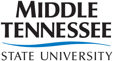
2-color version or four-color version MIDDLE TENNESSEE and STATE UNIVERSITY are black; only the "swash" is blue.