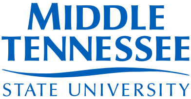
one-color version: Pantone Matching System (PMS 300)