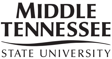
one-color version: all black